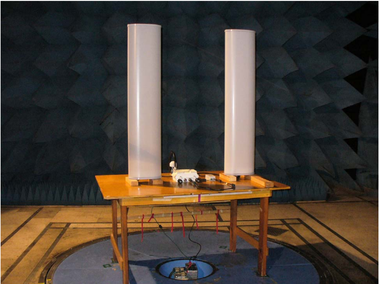
Figure 1: Radiated Emissions – Front View