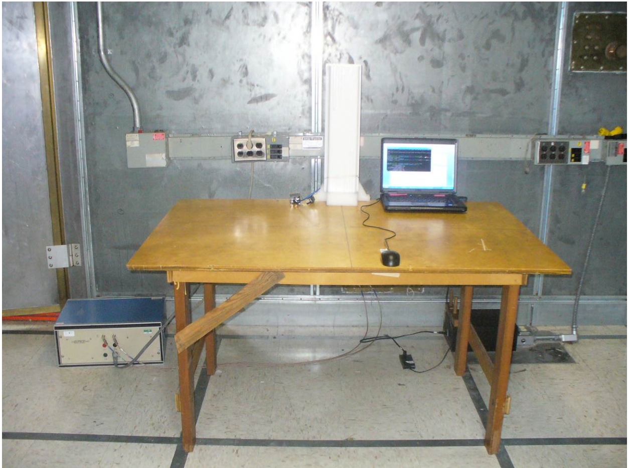
Figure 4: Power Line Conducted Emissions – Front View