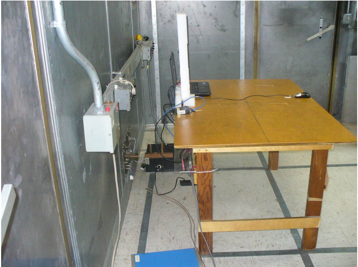
Figure 5: Power Line Conducted Emissions – Side View