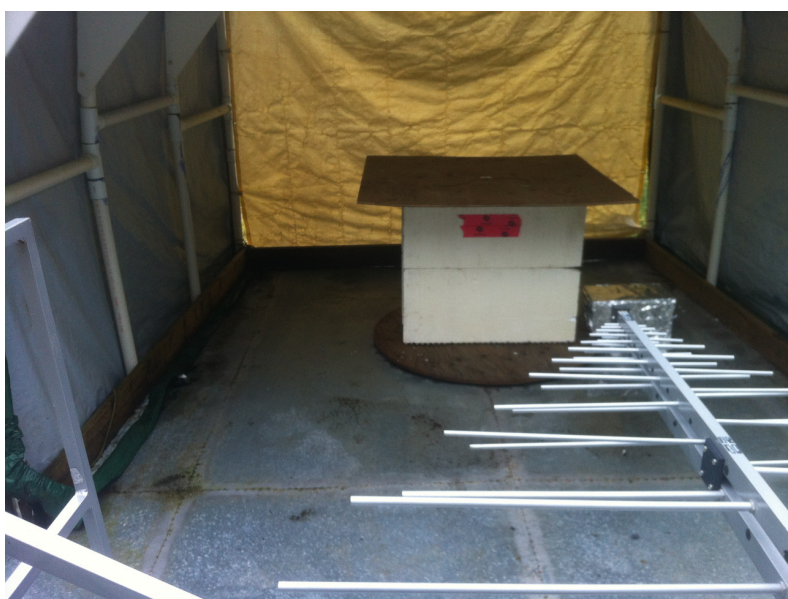
FIGURE 2 - RADIATED EMISSIONS