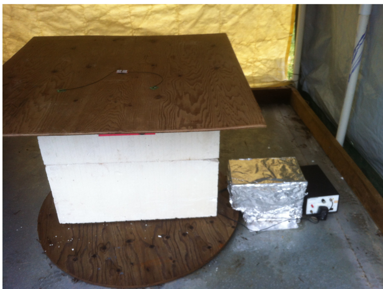
FIGURE 1 - POWERLINE CONDUCTED EMISSIONS