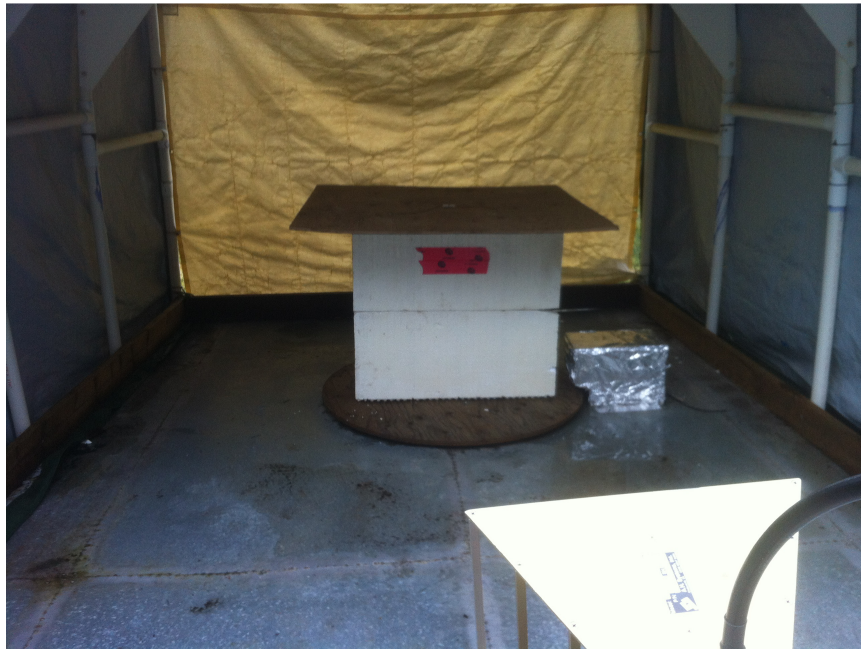
FIGURE 3 - RADIATED EMISSIONS