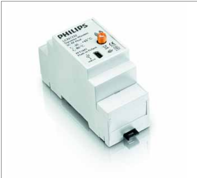
RF Module (LCN7330)

The RF module is based on the same Radio Frequency (RF) technology as the OLC and is connected to the CPU via the USB cable. This connection transfers all commands and data to and from the RF module. For optimal communication the Smart Disc Antenna is connected to the RF module and mounted on the outside of the cabinet. The RF module of Starsense Wireless operates between 906 and 924Mhz (IEEE 802.15.4) and connects to the OLC's using mesh networking . It is designed and produced by Philips and is mounted on the DIN rail.