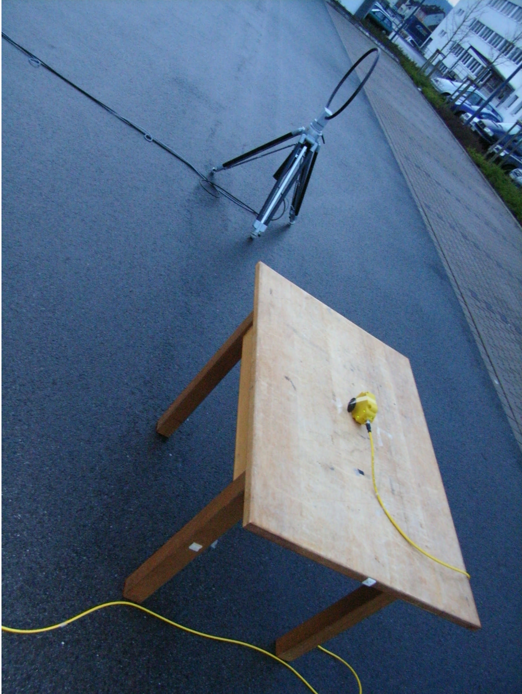
70711_g4.jpg TNER-Q80-H1147, test set-up outdoor test site

Annex A of test report R70711_G Edition 1 EUT: TNER-Q80-H1147 Manufacturer: Turck, Werner GmbH & Co. KG