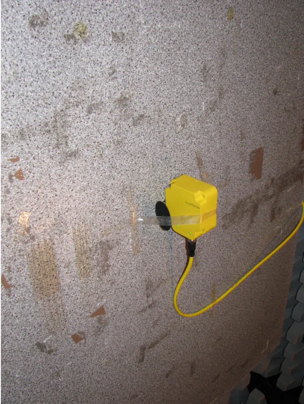
70711_g2.jpg TNER-Q80-H1147, test set-up fully anechoic chamber

Annex A of test report R70711_G Edition 1 EUT: TNER-Q80-H1147 Manufacturer: Turck, Werner GmbH & Co. KG