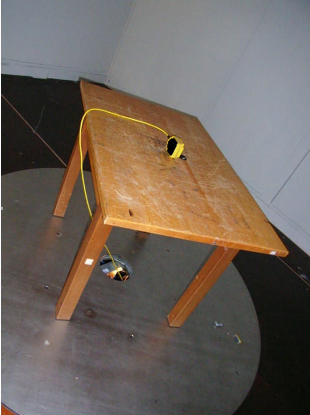
70711_g5.jpg TNER-Q80-H1147, test set-up open area test site

Annex A of test report R70711_G Edition 1 EUT: TNER-Q80-H1147 Manufacturer: Turck, Werner GmbH & Co. KG