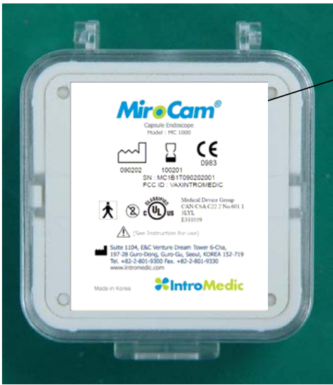
Capsule box I.D Label