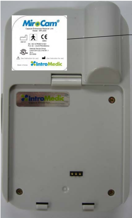
Receiver I.D Label