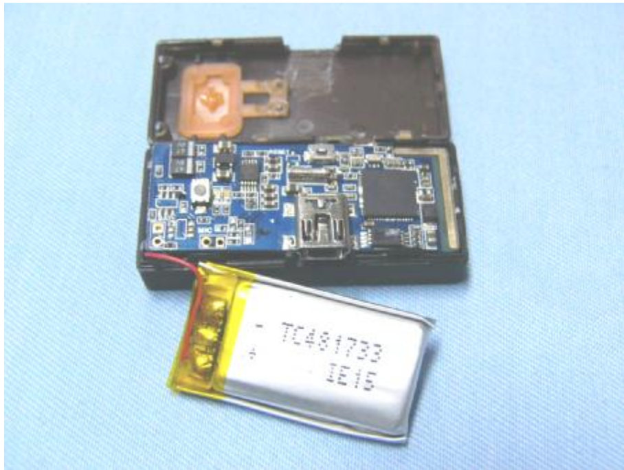
Main board component side