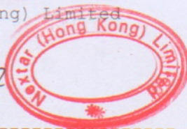
(Joyce Wang) (Marketing)