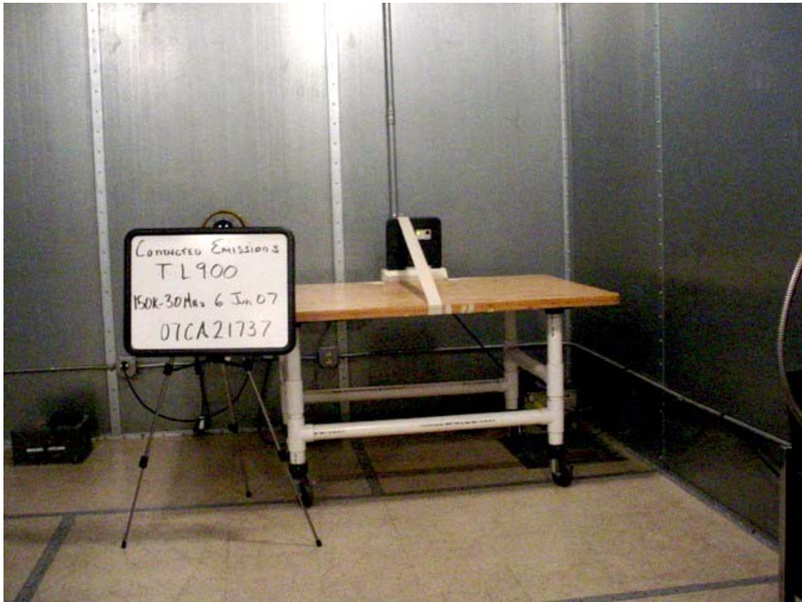
Conducted Emissions test set up 150KHz- 30MHz