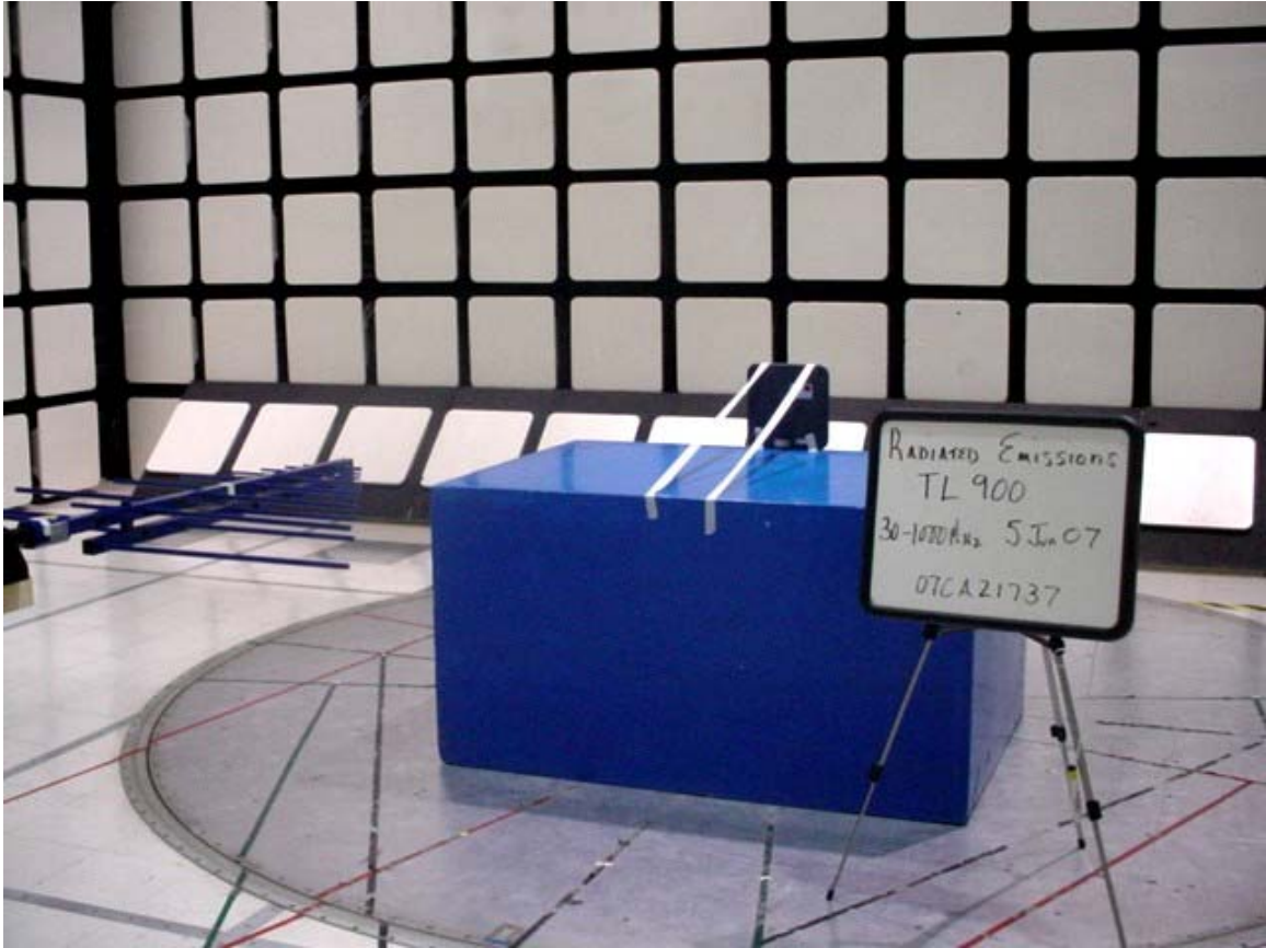
Radiated Emissions test set up 30MHz-1GHz Rear View