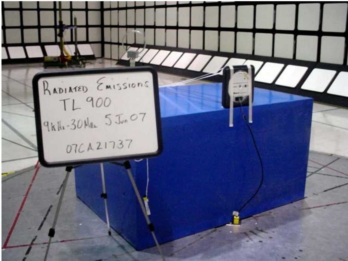
Radiated Emissions test set up 9KHz-30MHz Rear View