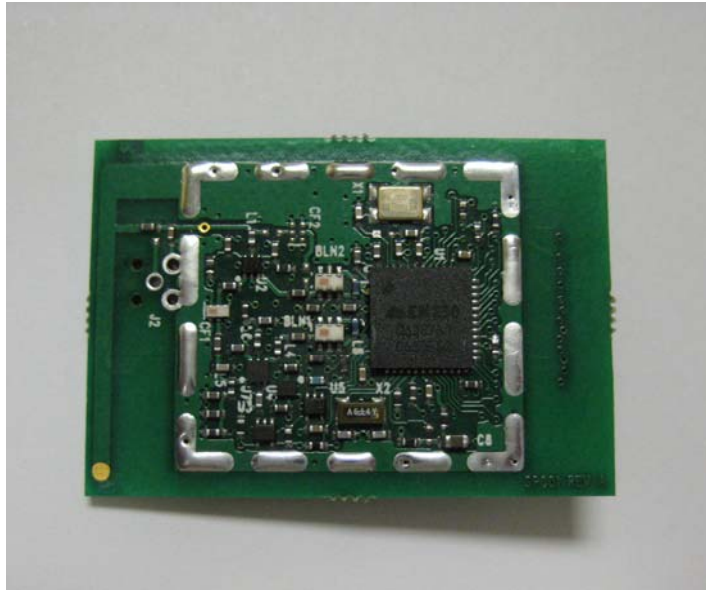
View #1 Module RF Section – Shield Removed