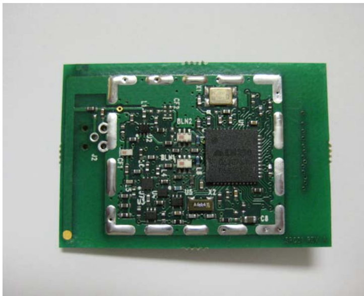
View #2 Module RF Section – Shield Removed