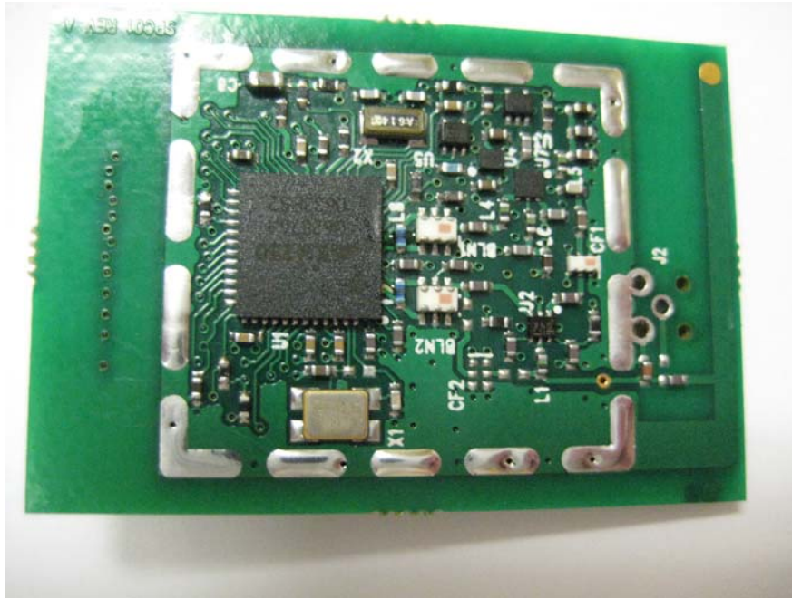
View #1, Close up of Module RF Section (Shield removed)