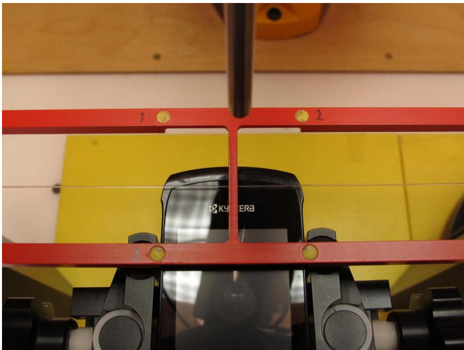
Figure 1b – HAC Tcoil Emission Test Setup