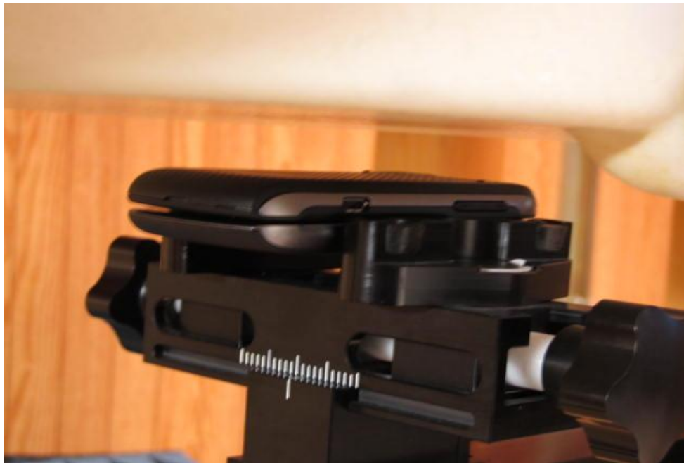
Figure 9E.3 Phone Closed 15mm Back