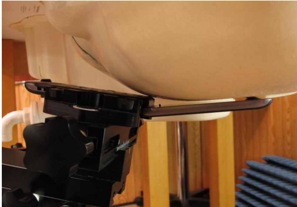
Figure 9E.1 Phone against the head (Left cheek position)