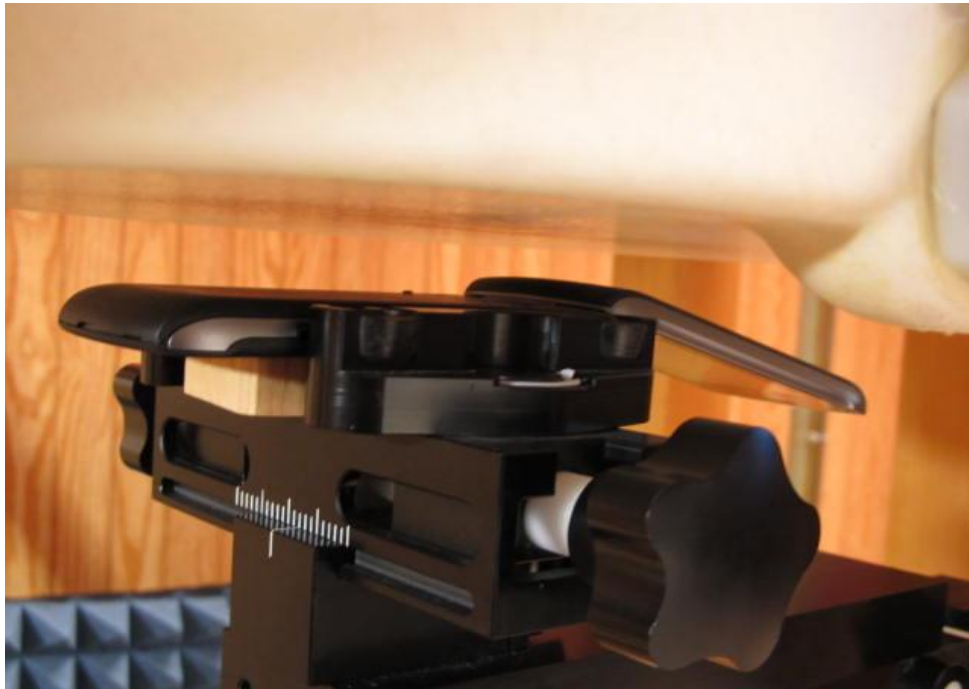
Figure 9E.5 Phone Open 15mm Back