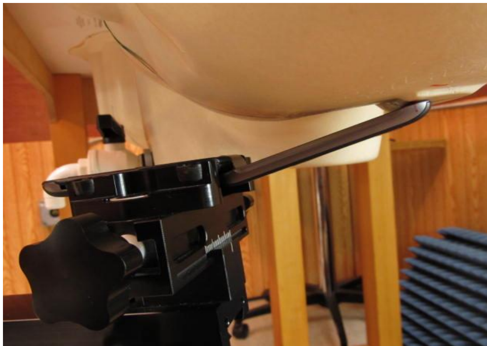
Figure 9E.2 Phone against the head (Left Tilt position)