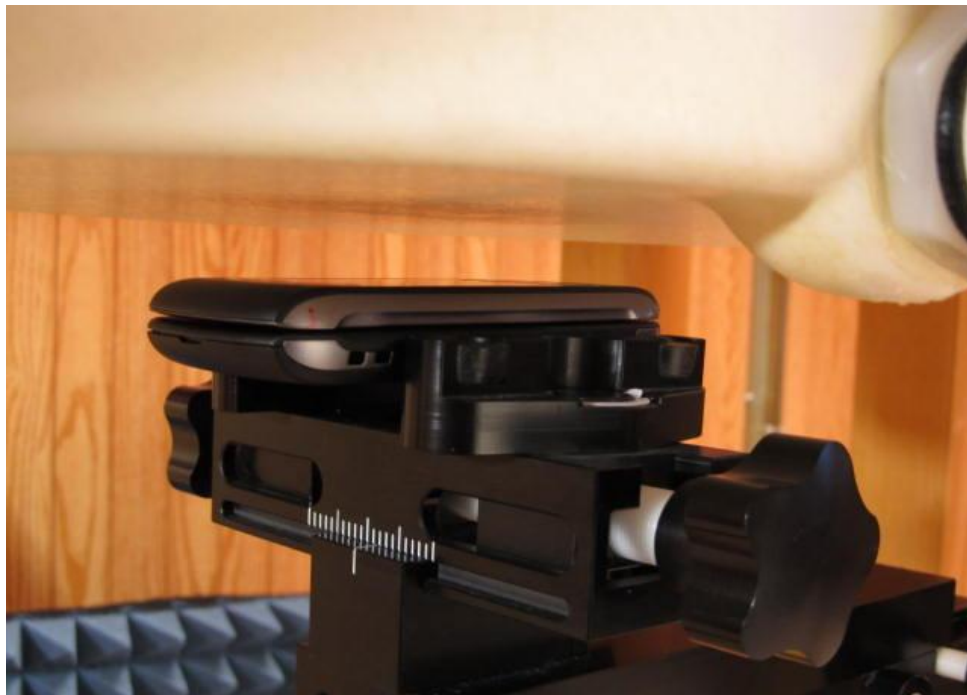
Figure 9E.4 Phone Closed 15mm Front