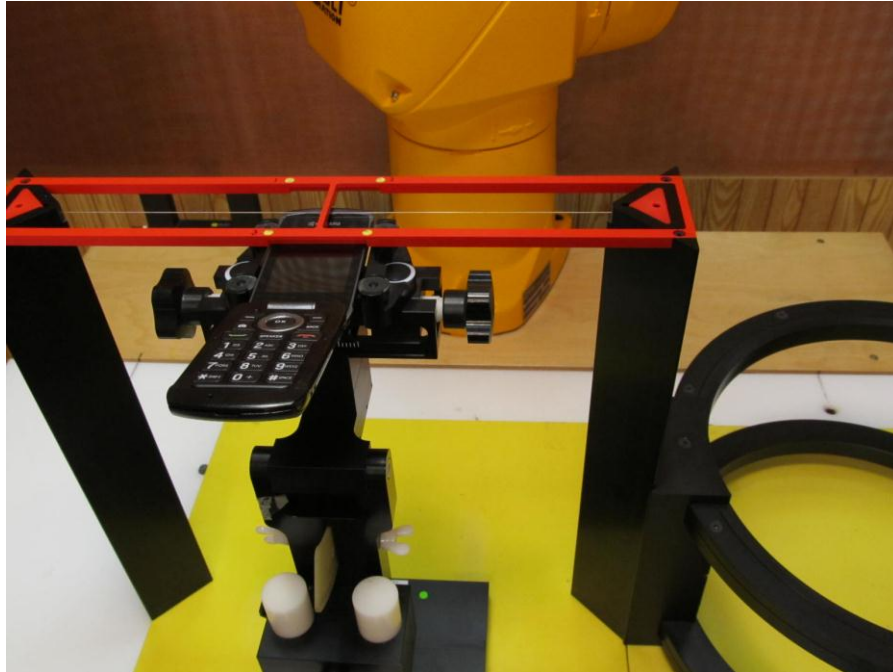
Figure 1a – HAC T-Coil Test Setup