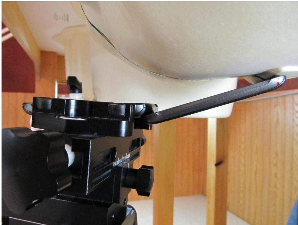
Figure 9E.2 Phone against the head (Left Tilt position)