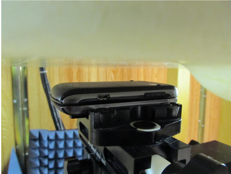
Figure 9E.3 Phone Closed 15mm Back