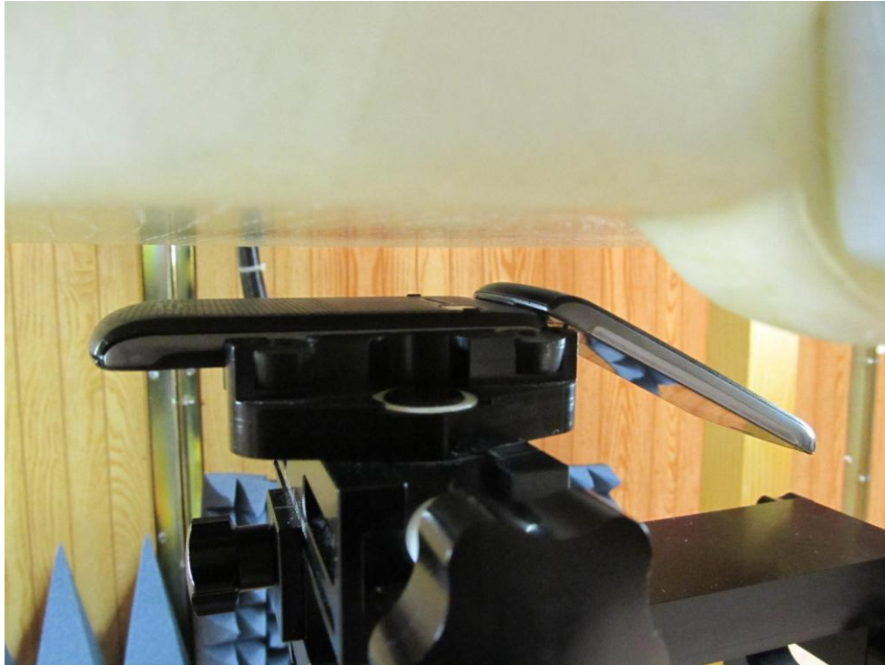
Figure 9E.5 Phone Open 15mm Back