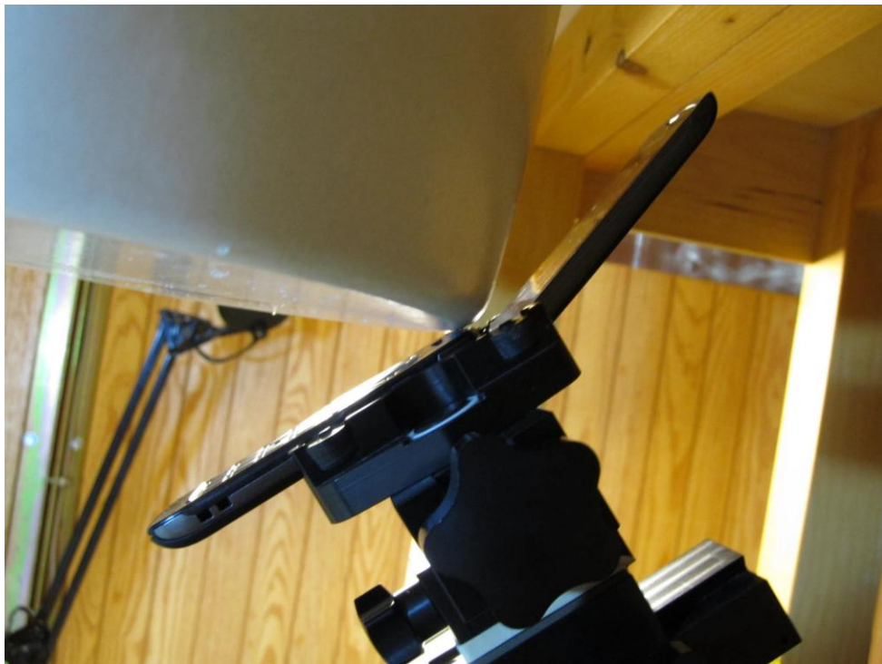
Figure 9E.6 Phone Open Jaw Position