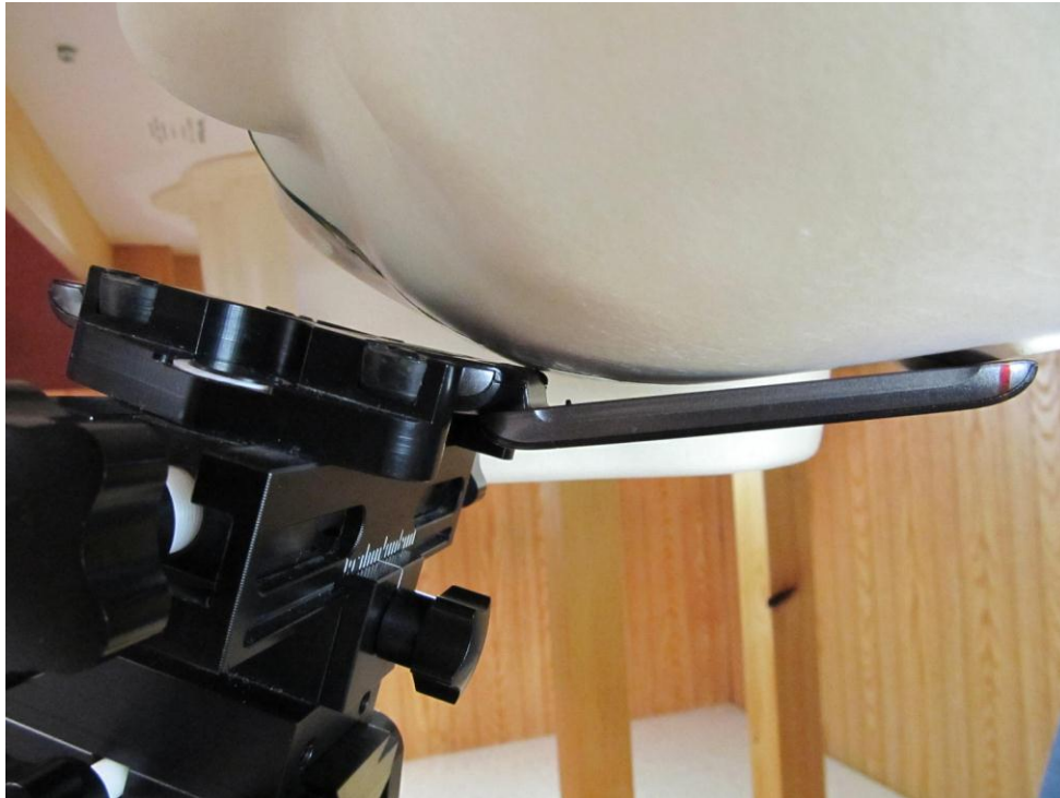
Figure 9E.1 Phone against the head (Left cheek position)