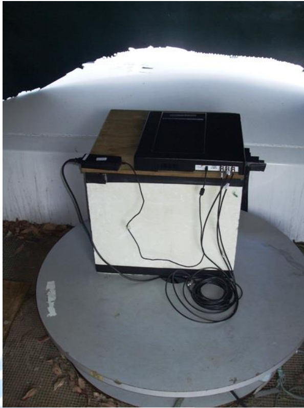
Below 1 GHz (80 cm)