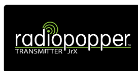
Actual Top Label (1:1 Scale)