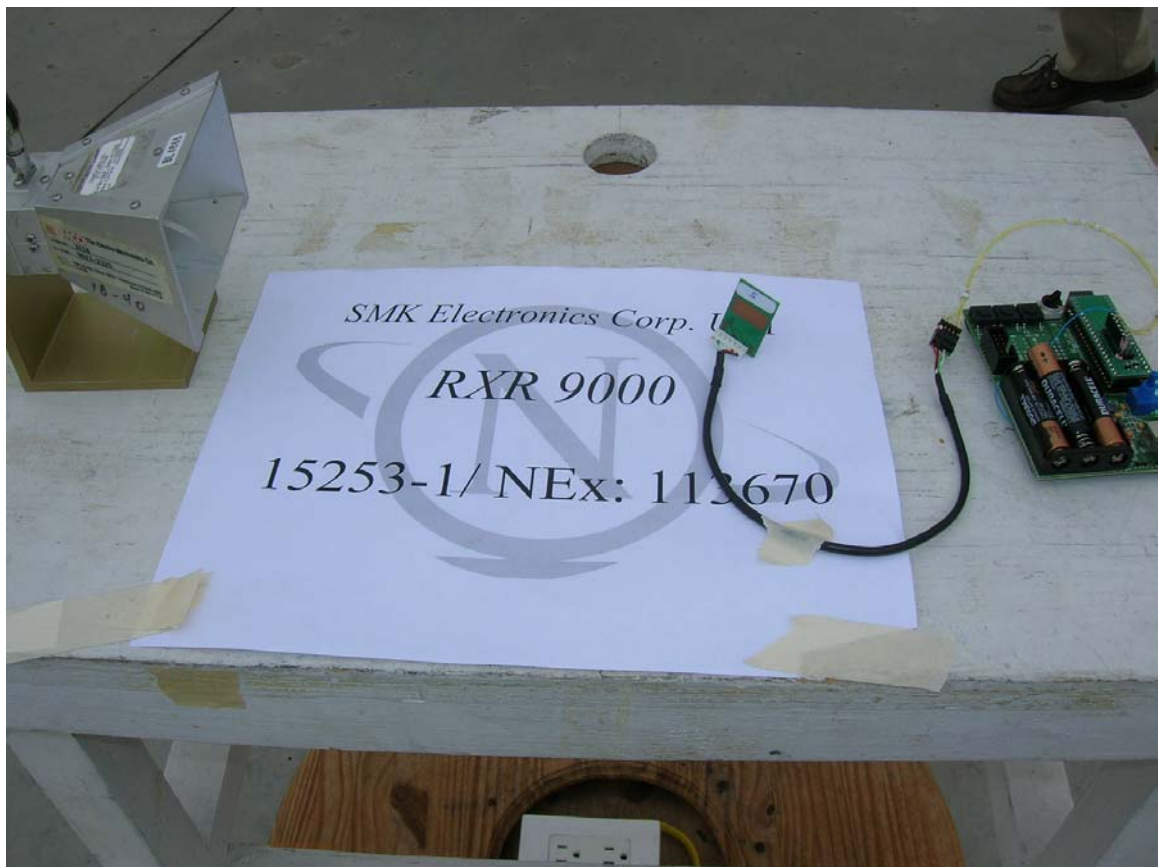
Verifying no emissions 18 GHz to 25 GHz