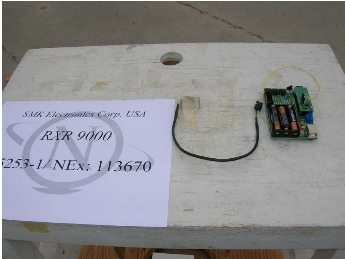
RF Module with testing rig, X axis