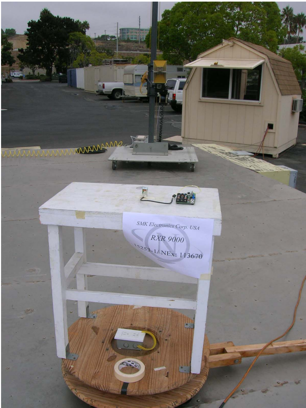
Measuring Fundamental power levels and Harmonic Spurious Emissions