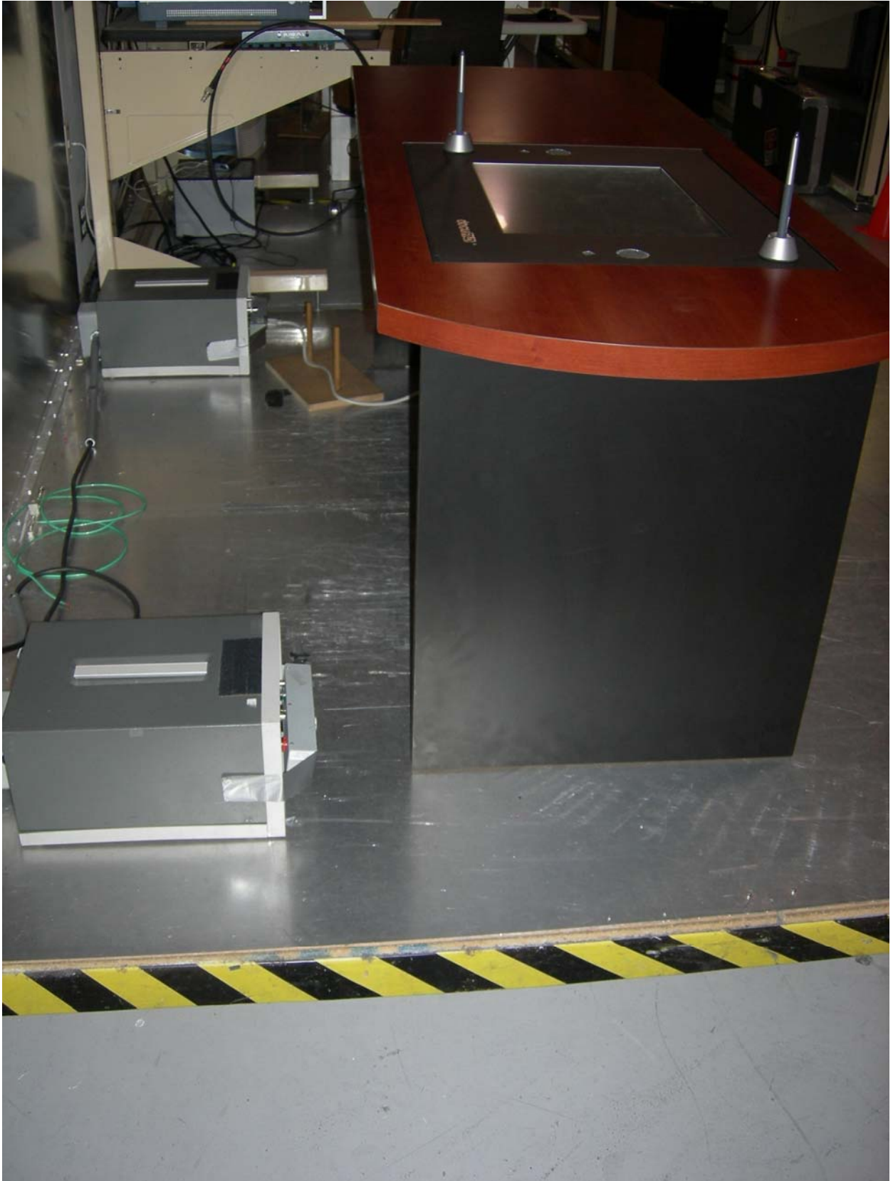
Figure 4: Conducted Emissions