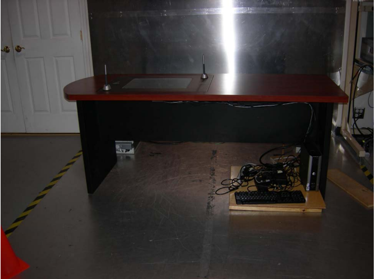
Figure 3: Conducted Emissions