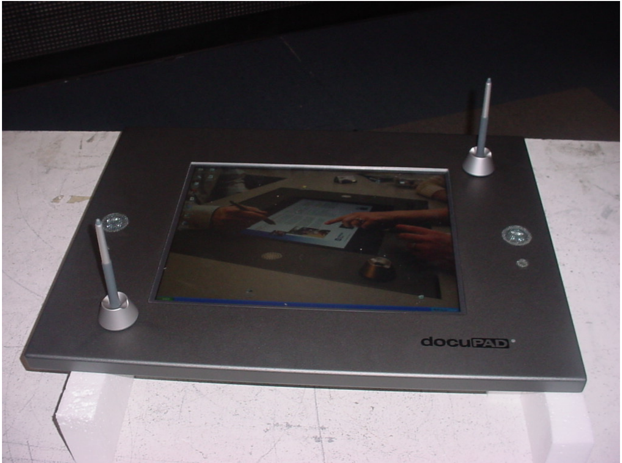
Figure 2: Radiated Emissions