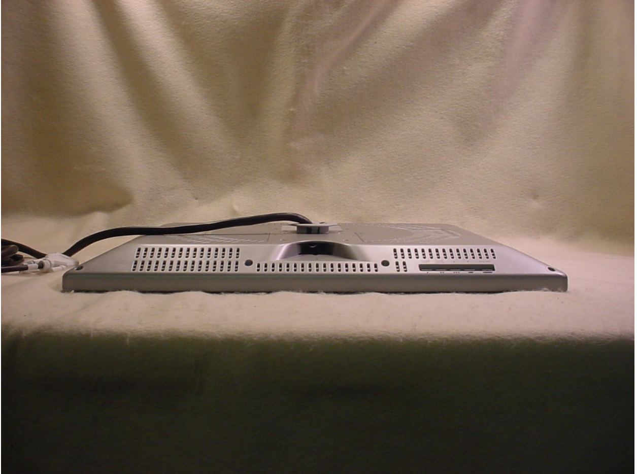
Figure 4: Bottom View