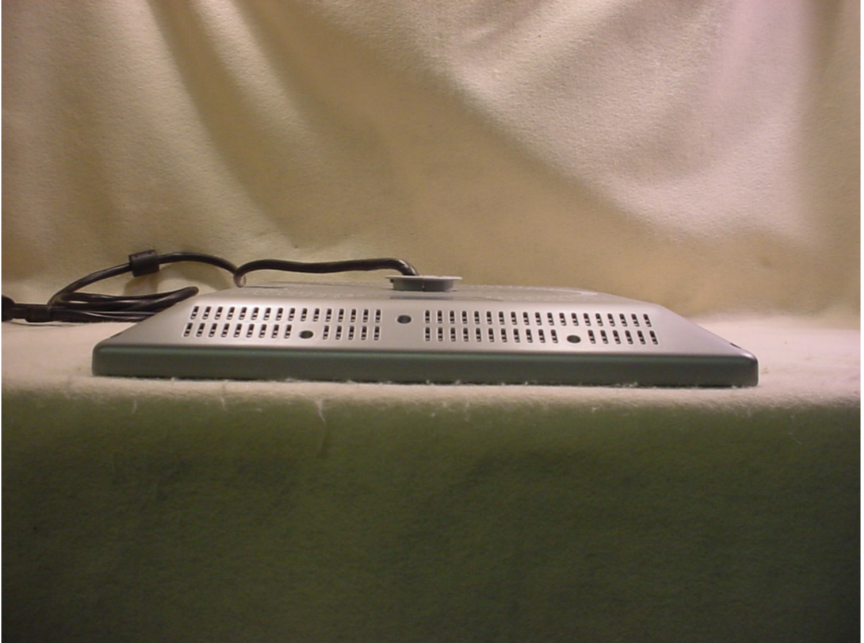
Figure 5: Side View