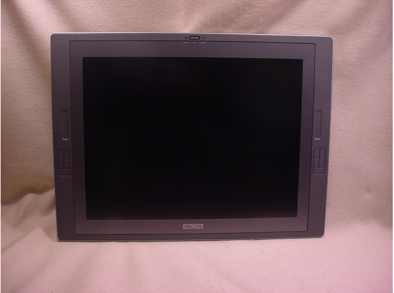
Figure 1: Front View