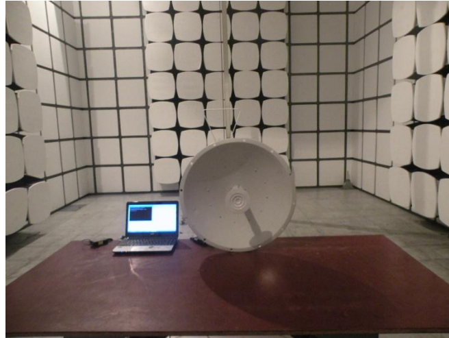
Photos of Radiated emission