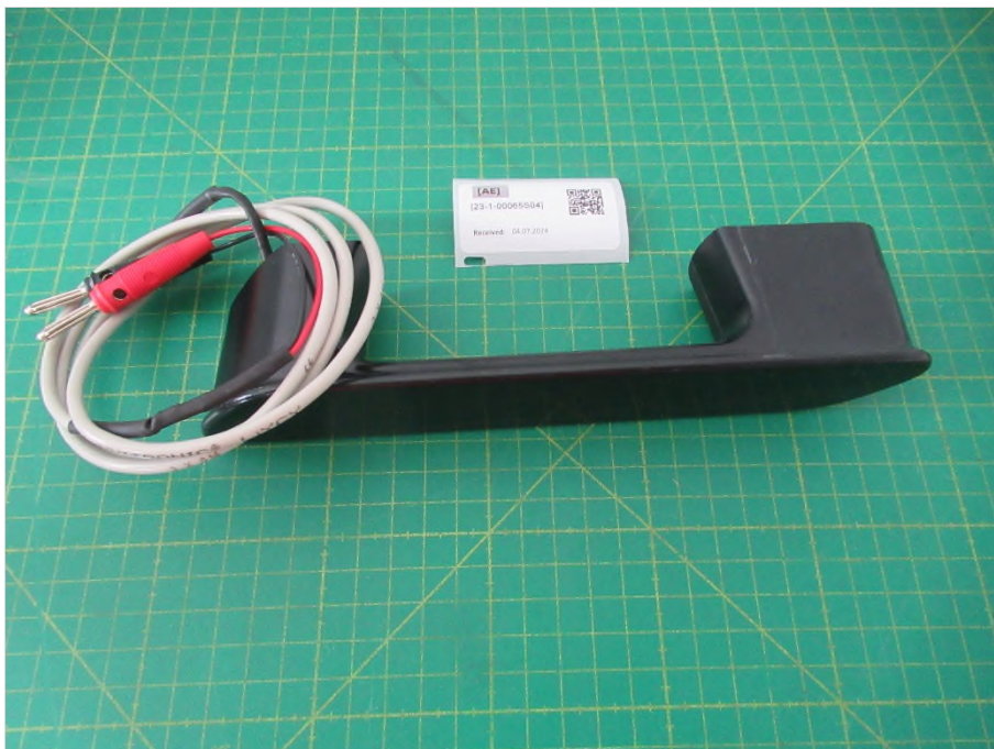
Photograph 2: EUT 1_Top side view