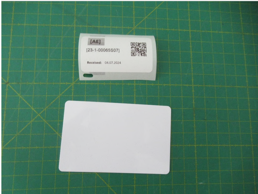
Photograph 5: AE 1