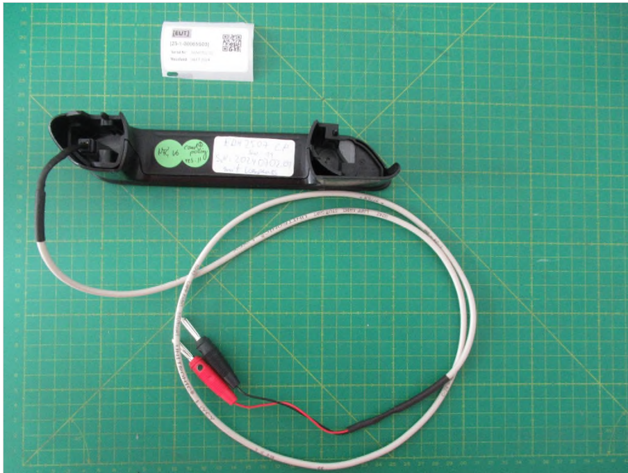
Photograph 3: EUT 2_Back side view