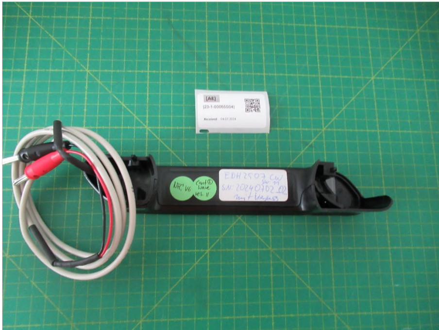
Photograph 1: EUT 1_Back side view