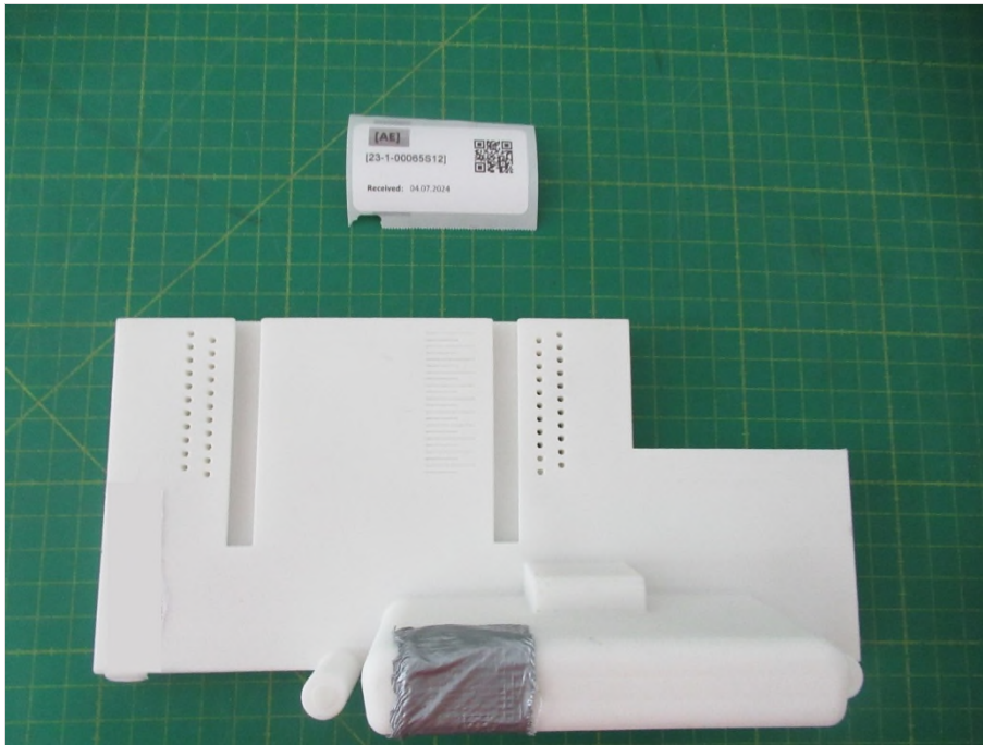
Photograph 7: AE 3