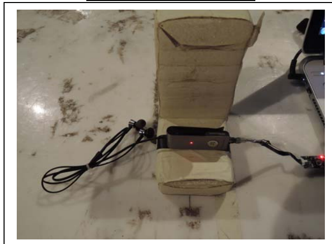
EUT Position: Z-axis