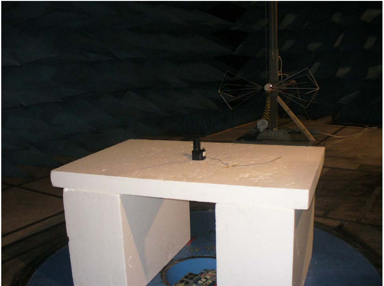
Figure 3: Radiated Emissions – Back View – 30 MHz – 200 MHz