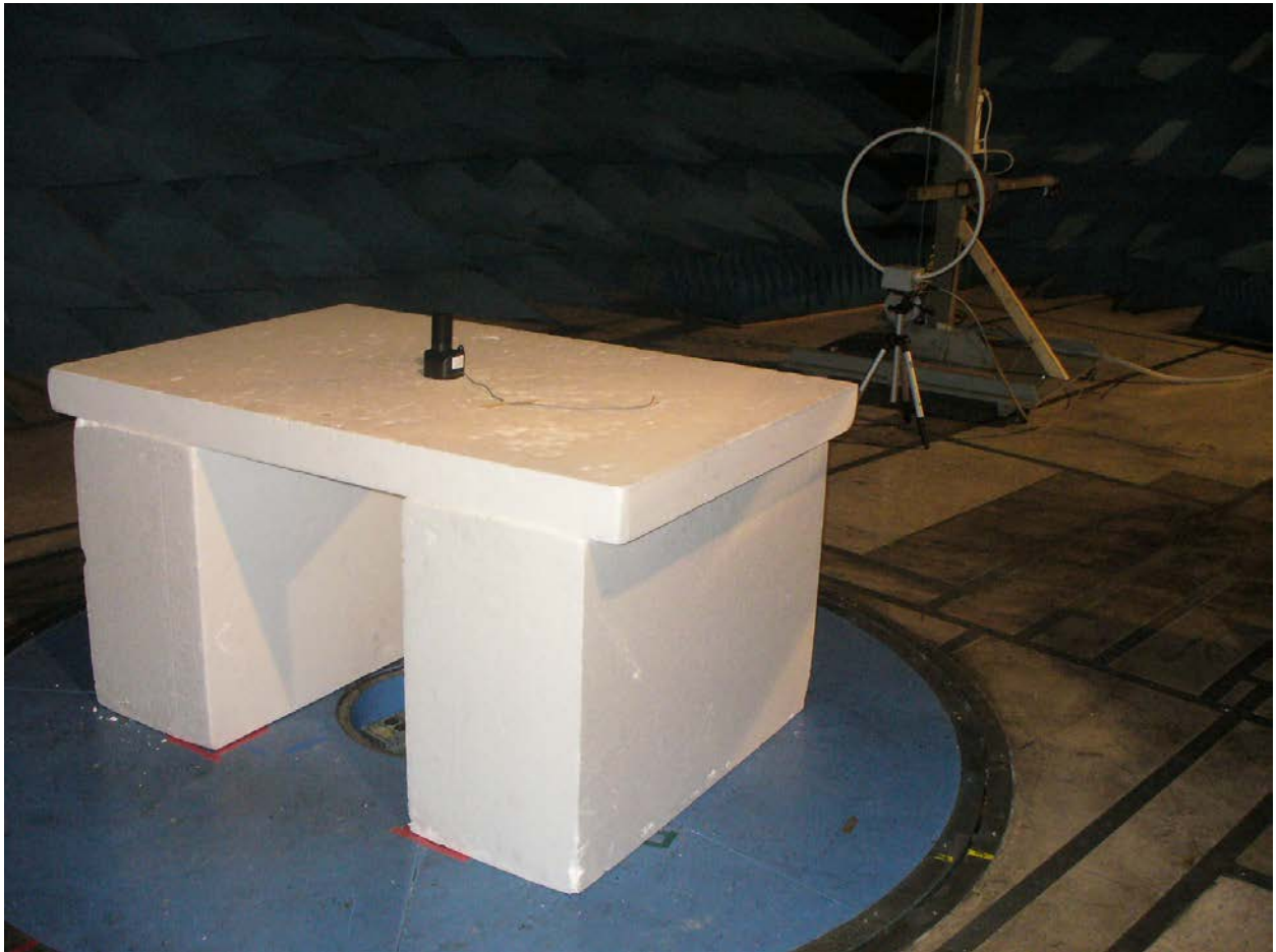
Figure 2: Radiated Emissions – Back View – 9 kHz – 30 MHz