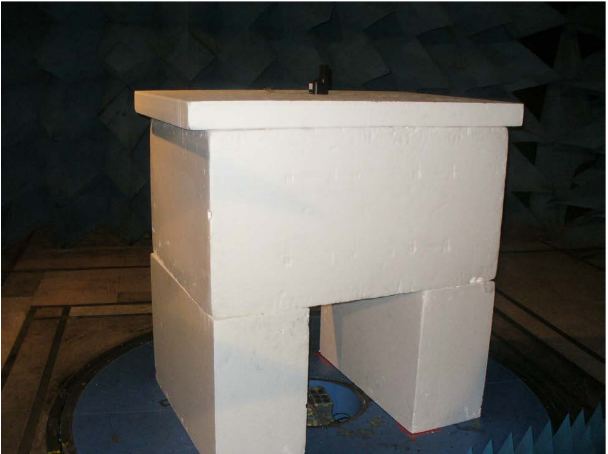
Figure 5: Radiated Emissions – Front View – Above 1 GHz