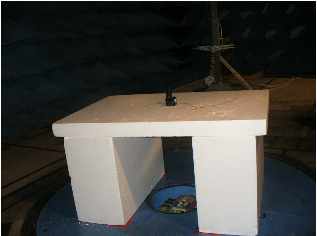
Figure 4: Radiated Emissions – Back View – 200 MHz – 1 GHz