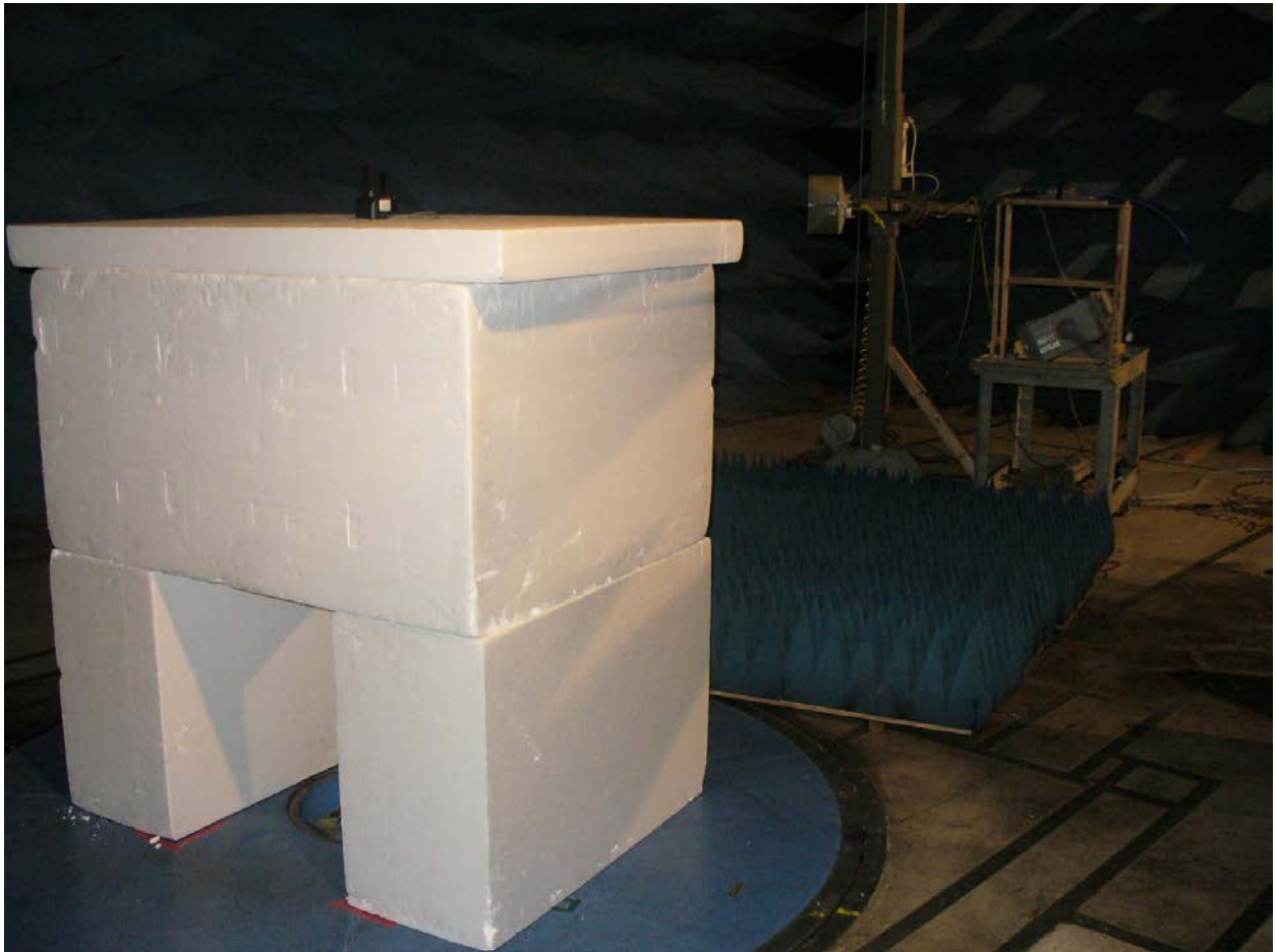
Figure 6: Radiated Emissions – Back View – Above 1 GHz