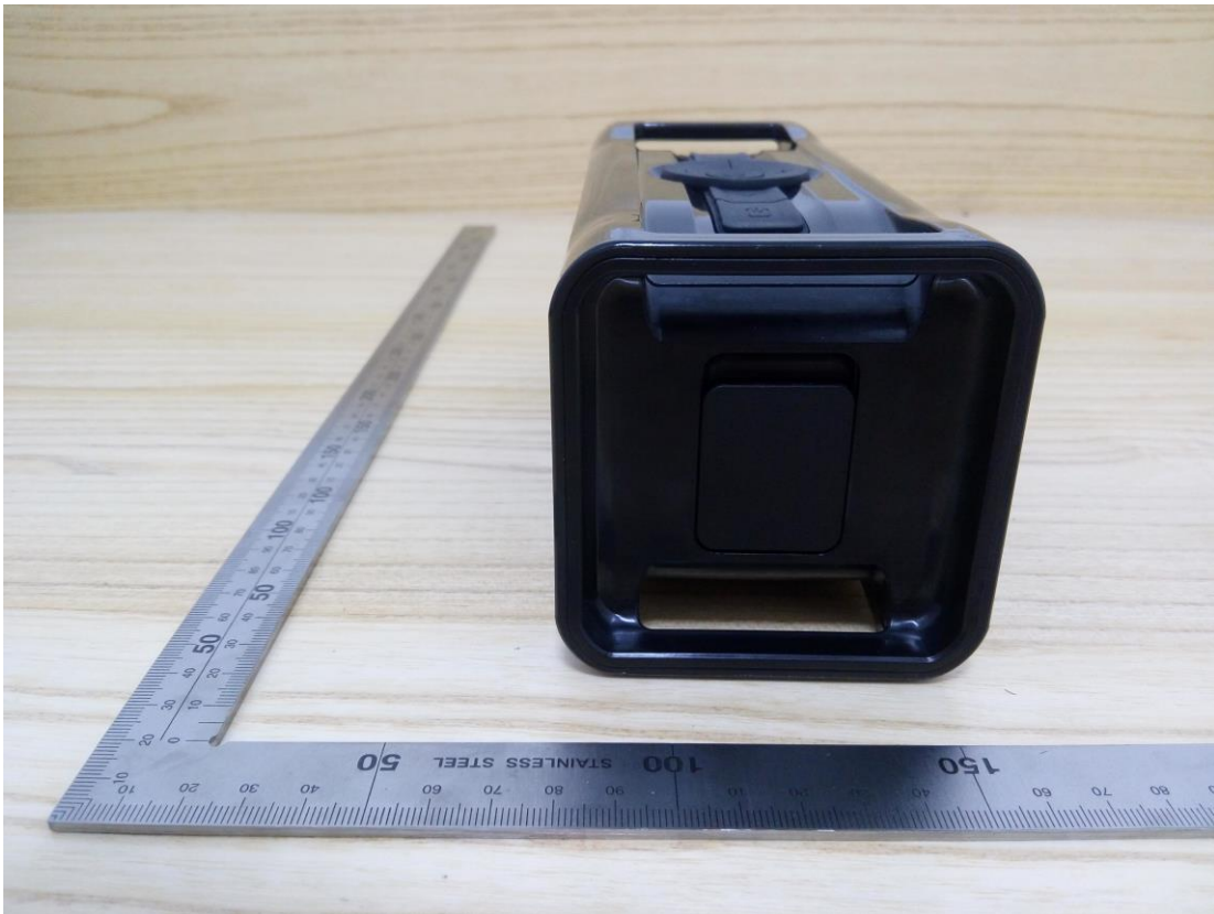
Detail View of EUT-1