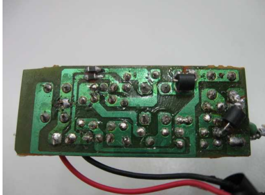
Inner Circuit Top View