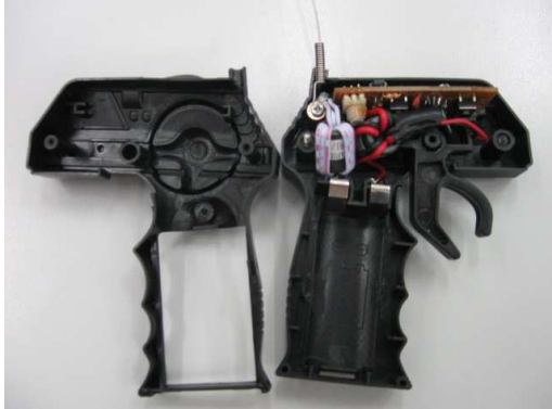
Front View of the product (Internal)