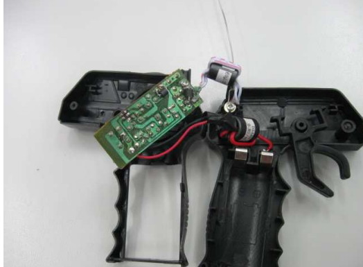
Rear View of the product (Internal)