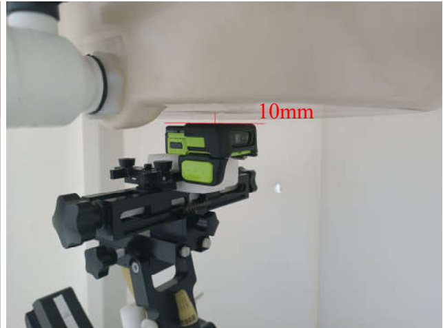
Front + Replacement protective shell + Two-finger mount, Test Separation 10 mm