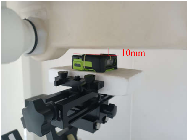
Front + Replacement protective shell, Test Separation 10 mm