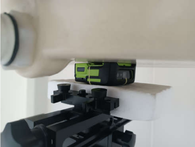
Back + Replacement protective shell, Test Separation 0 mm