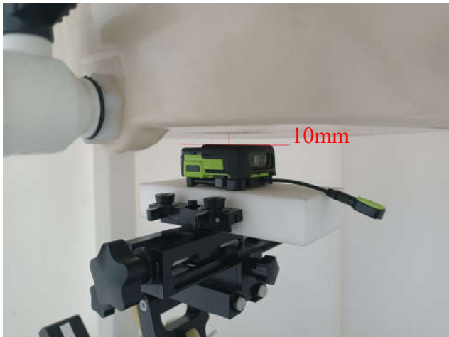
Front + Replacement protective shell + Back of Hand mount, Test Separation 10 mm