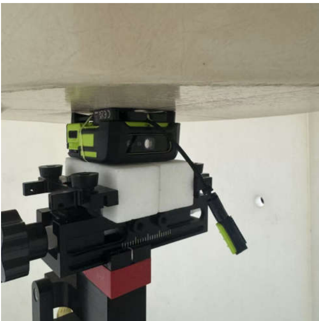
Back + Replacement protective shell + Back of Hand mount, Test Separation 0 mm