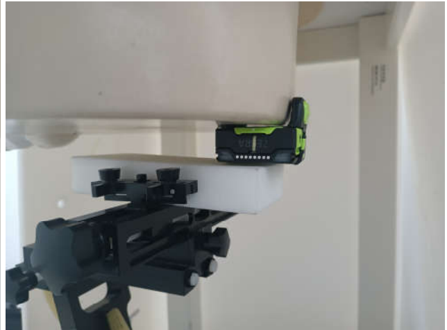
Back + Replacement protective shell + Two-finger mount, Test Separation 0 mm