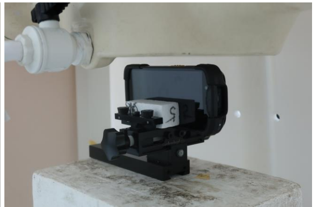
Left Side at 10 mm