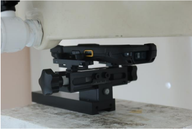
Front at 10 mm