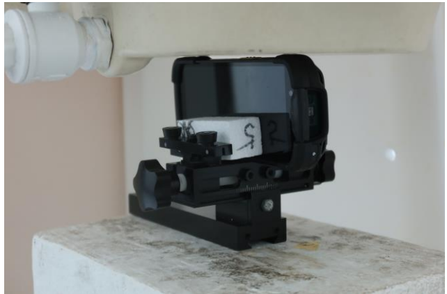
Left Side at 0 mm