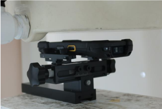
Front at 15 mm