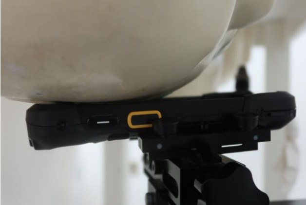
Right Cheek at 0mm