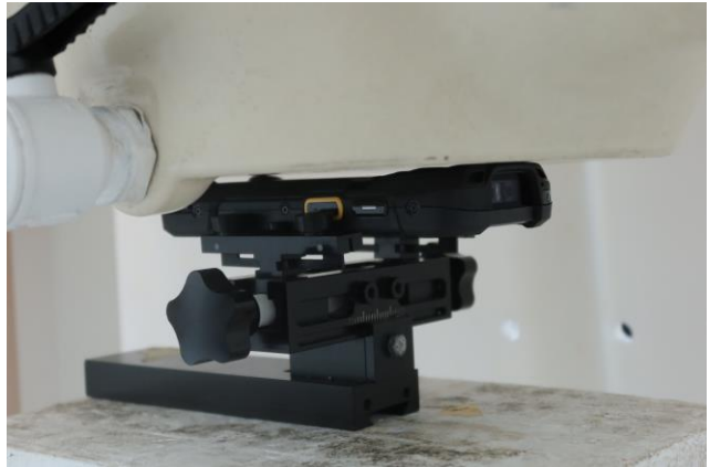
Back at 0 mm