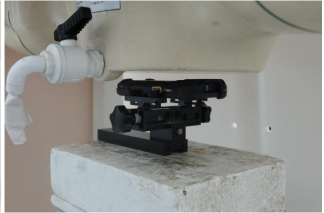
Back at 10 mm