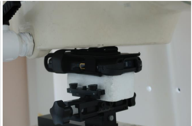
Back with Soft Holster at 0 mm