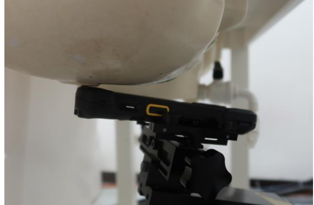
Right Tilted at 0mm