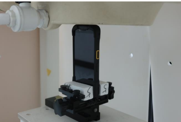
Top Side at 0 mm