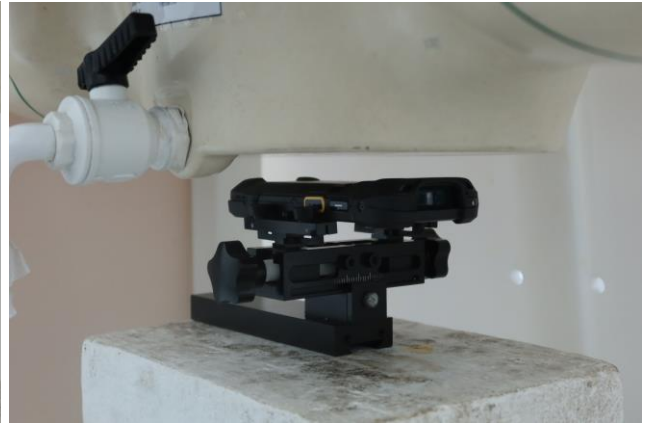
Back at 15 mm