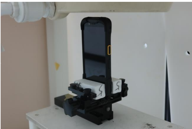
Top Side at 10 mm