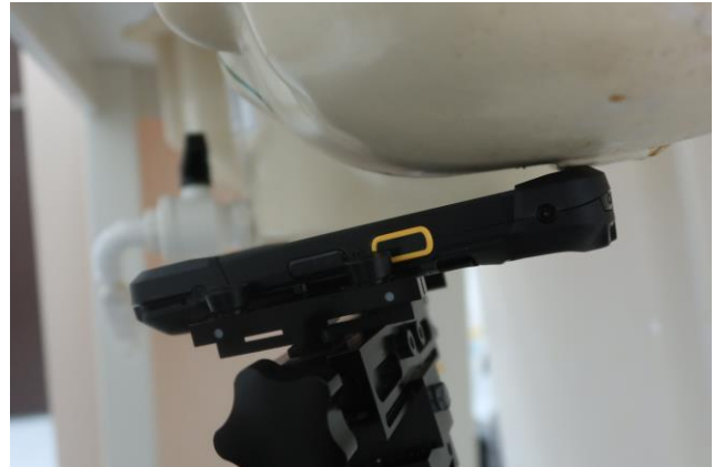
Left Tilted at 0mm