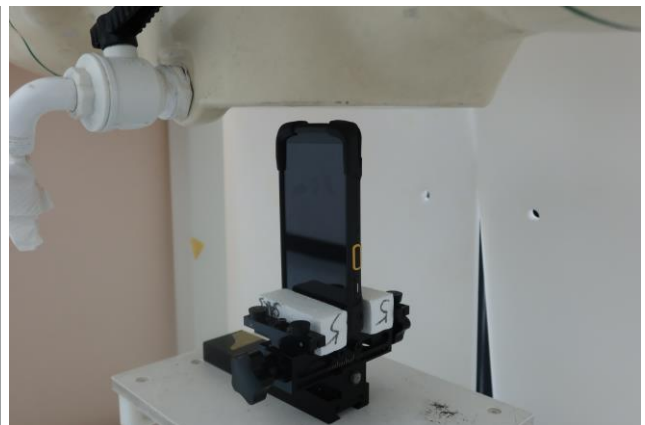
Bottom Side at 10 mm