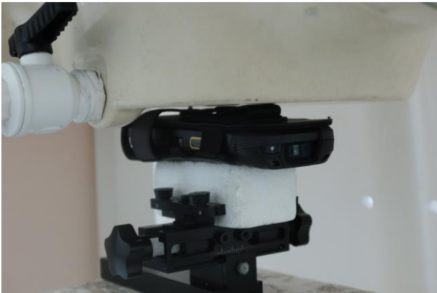
Front with Soft Holster at 0 mm