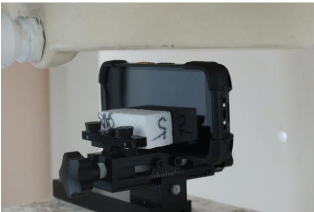
Right Side at 10 mm