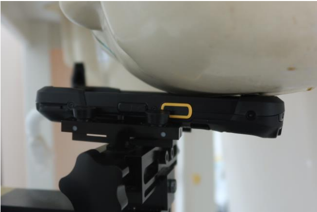
Left Cheek at 0mm