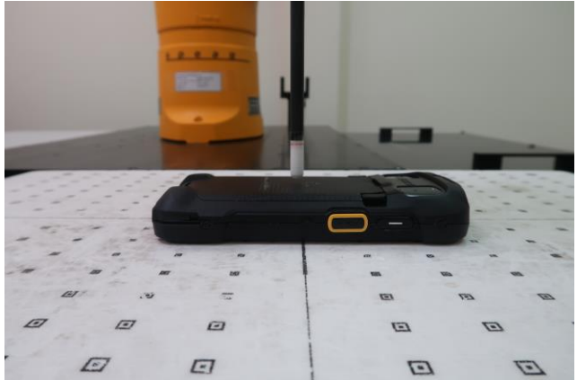
Back at 2 mm