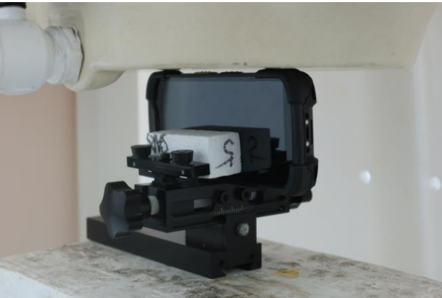
Right Side at 0 mm