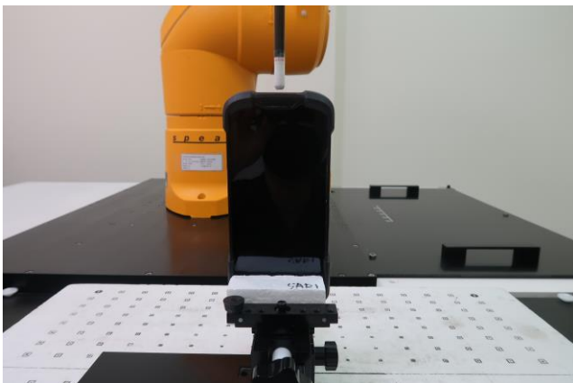
Top Side at 2 mm