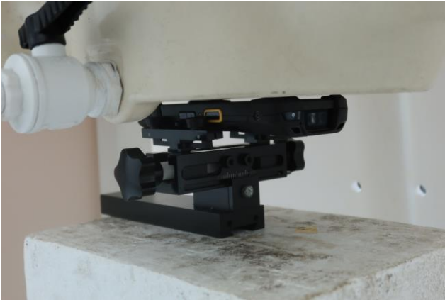
Front at 0 mm