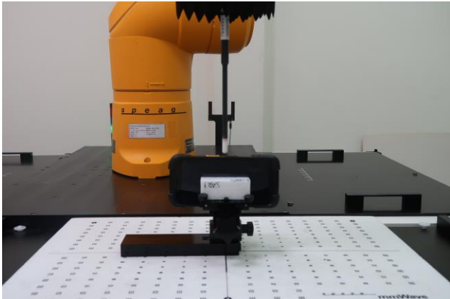
Right Side at 2 mm