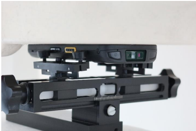
Front + Battery 1 at 0 mm