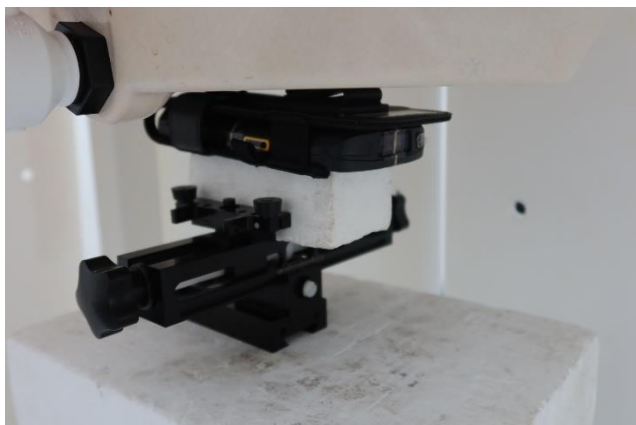
Back + Holster + Battery 1 at 0 mm