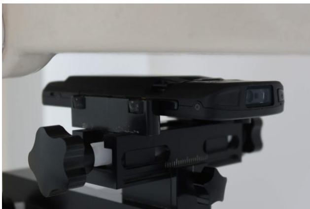
Back + Battery 4 at 15 mm