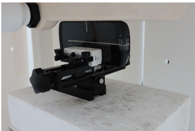
Left Side+ Battery 1 at 0 mm