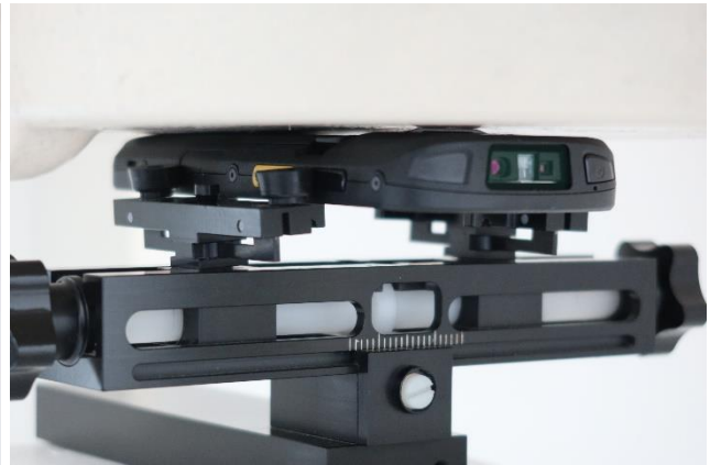
Back + Battery 1 at 0 mm