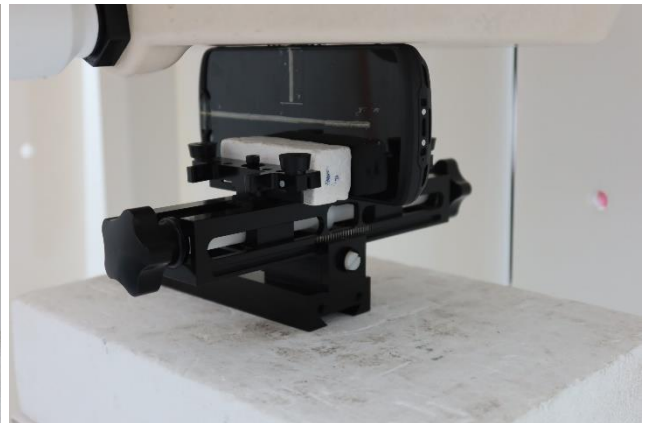
Right Side + Battery 4 at 0 mm