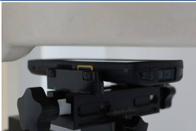
Front + Battery 1 at 15 mm