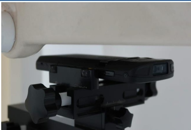
Back + Battery 1/2/3 at 15 mm