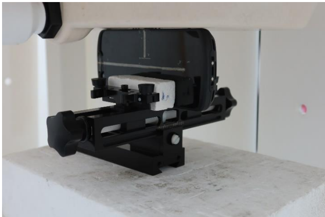
Right Side + Battery 1/2/3 at 0 mm