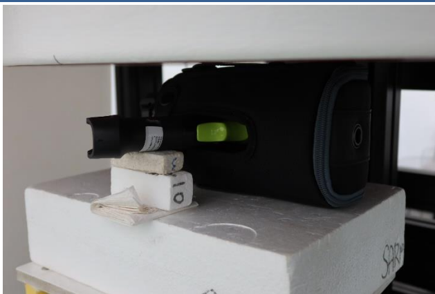
Right Side with Holster at 0 mm