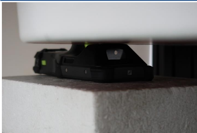
Back at 0 mm