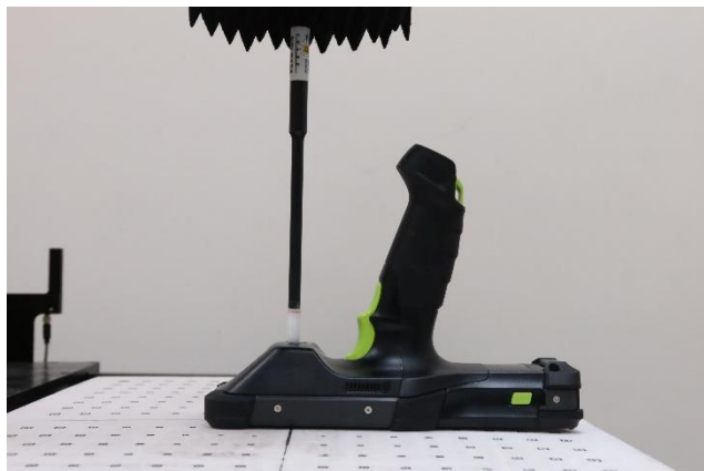
Back at 2 mm