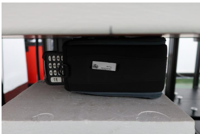
Left Side with Holster at 0 mm