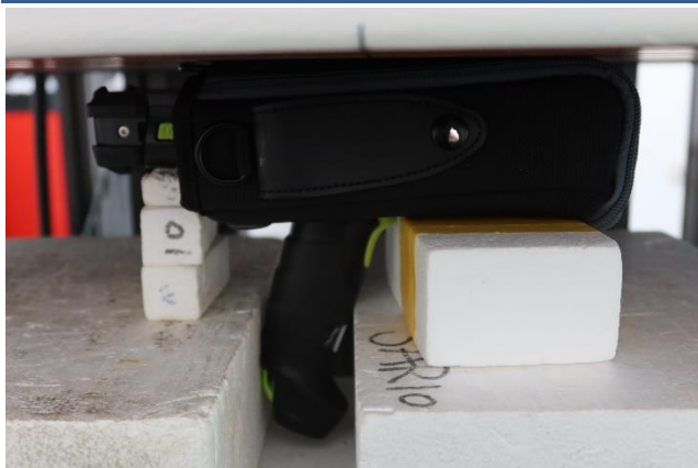
Front with Holster at 0 mm