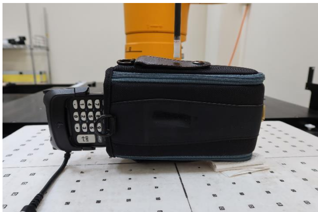
Left Side with Holster at 2 mm