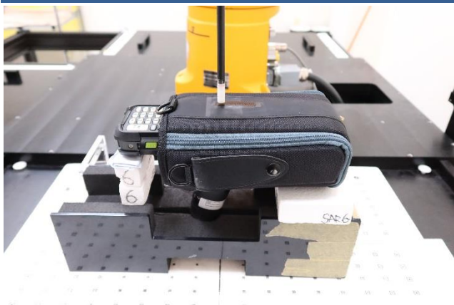
Front with Holster at 2 mm