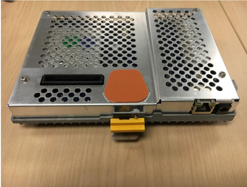
21-199765-01 (FX-7508 with outer shield)

The modular transmitter must have its own RF shielding