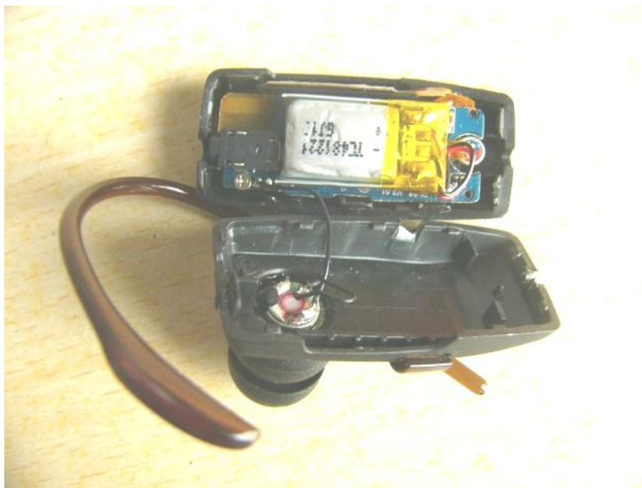
Main board component side