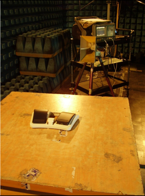
Foot pedal. Radiated emissions test setup at 1m distance.