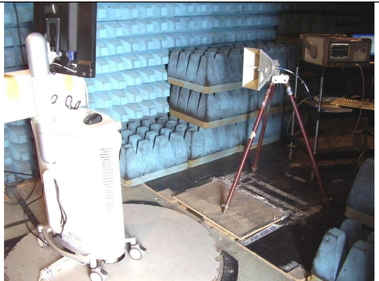
iTero cart with USB dongle. Radiated emissions test setup at 1m distance.