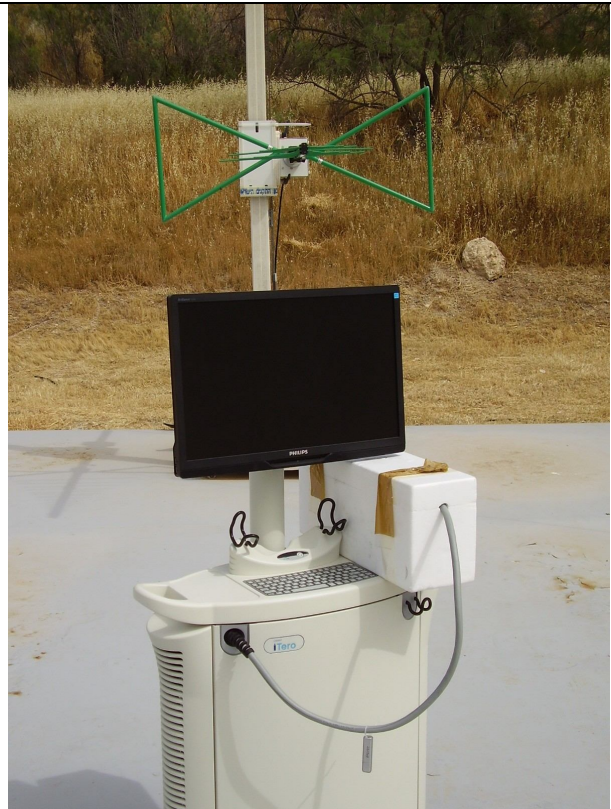
iTero cart with USB dongle. Radiated emissions test setup on OATS.