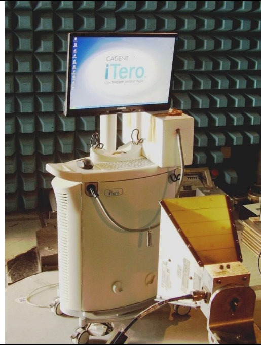
iTero cart with USB dongle. Radiated emissions test setup at 1m distance.