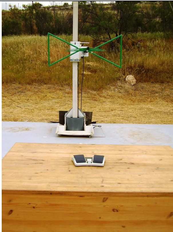
Foot pedal. Radiated emissions test setup on OATS.