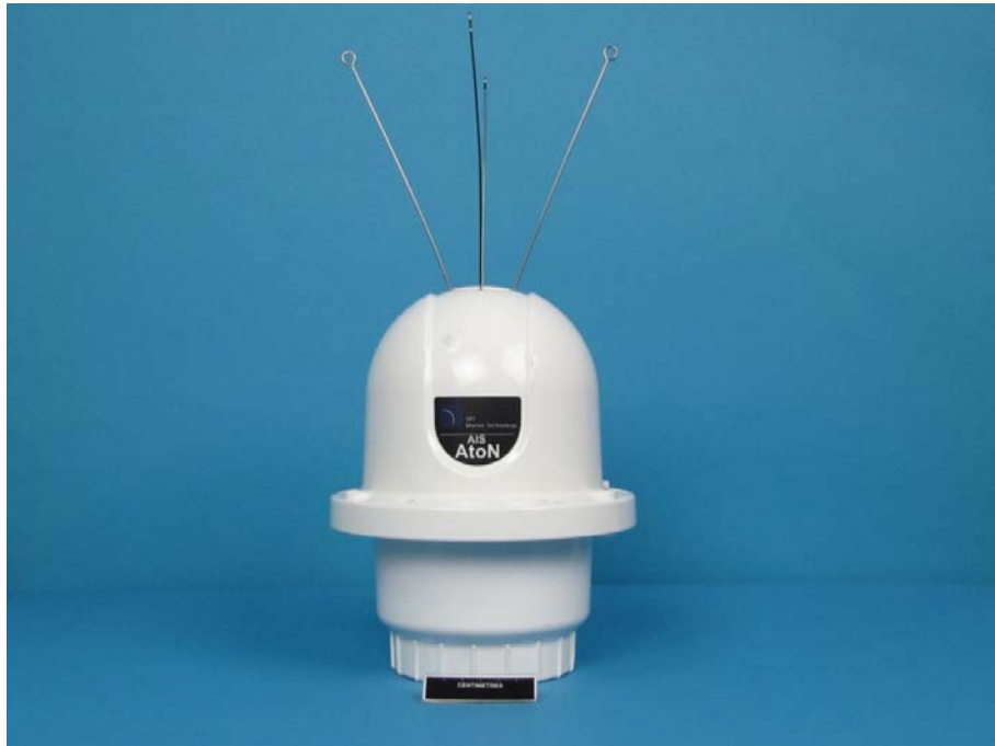
Equipment Under Test

The Equipment Under Test (EUT) was a SRT Marine Technology Ltd Carbon TRS-418-0003/TR-418-0001 as shown in the photograph below. A full technical description can be found in the manufacturer's documentation.