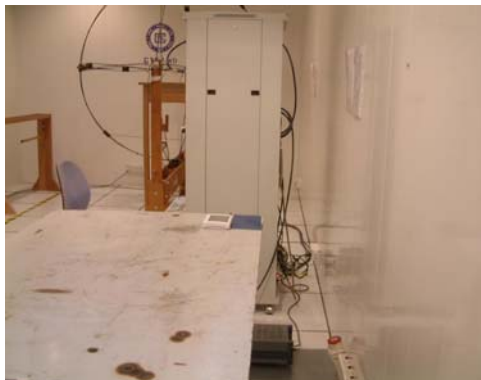
Side view of Conducted measurement

copyright of this report is owned by Centre of Testing Service and may not be reproduced other than in full except with the written approval of the issuing Company.