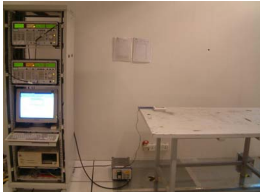
Front view of conducted measurement