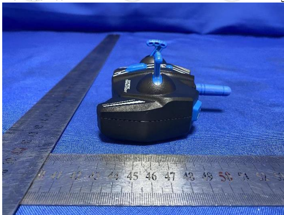
View of Product-3