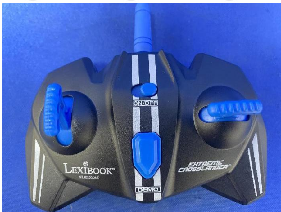
View of Product-6