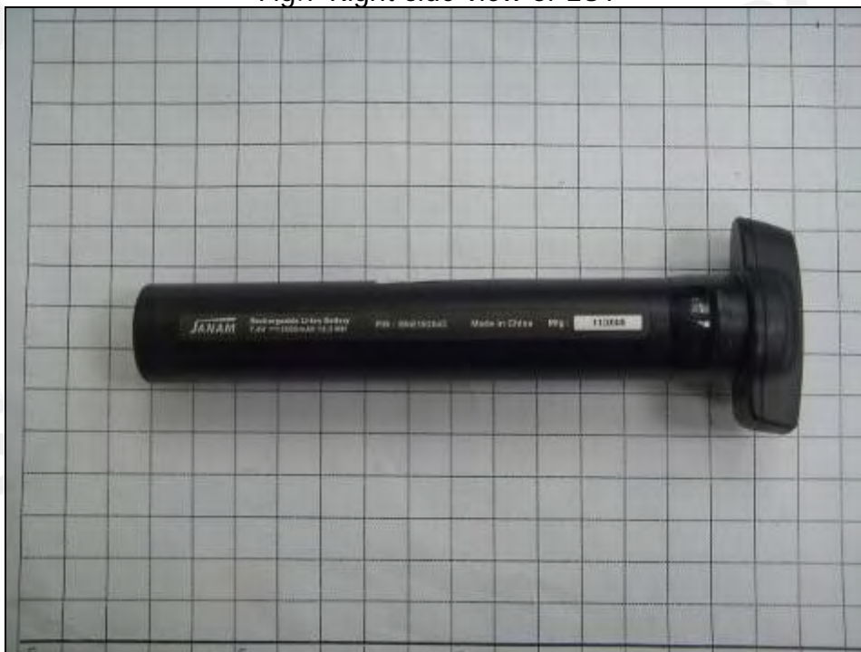
Fig.8 Front view of Battery

Unless otherwise stated the results shown in this test report refer only to the sample(s) tested and such sample(s) are retained for 90 days only. 除非另有說明，此報告結果僅對測試之樣品負責，同時此樣品僅保留90天。本報告未經本公司書面許可，不可部份複製。