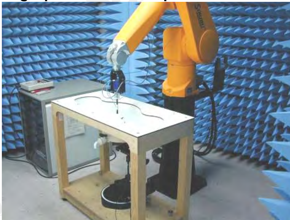
Fig.1 Photograph of the SAR measurement System