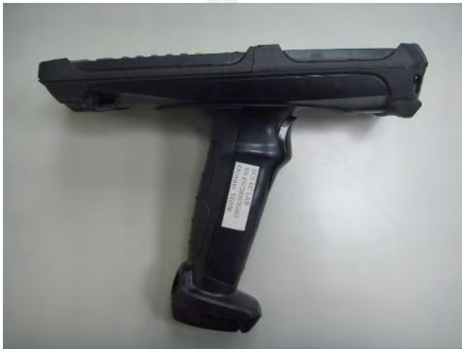
Fig.7 Right side view of EUT