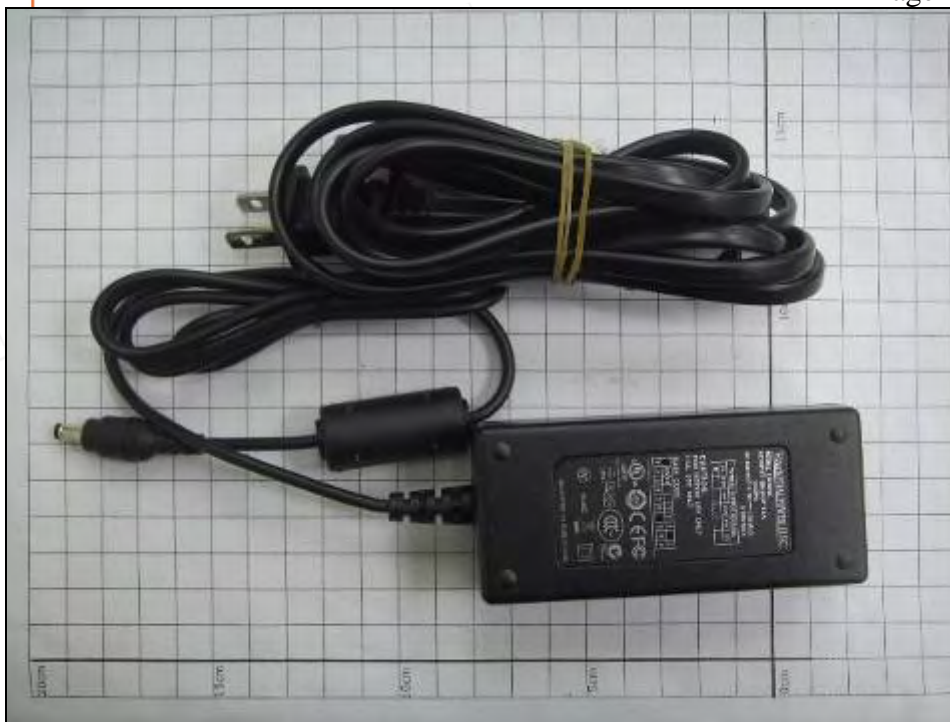
Fig.9 AC charger