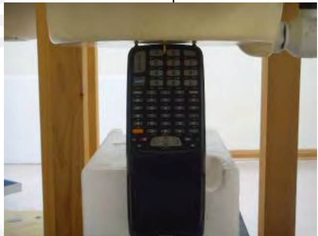
Fig.4 Bottom side of the EUT is paralleled and contact with flat phantom.

Unless otherwise stated the results shown in this test report refer only to the sample(s) tested and such sample(s) are retained for 90 days only. 除非另有說明，此報告結果僅對測試之樣品負責，同時此樣品僅保留90天。本報告未經本公司書面許可，不可部份複製。