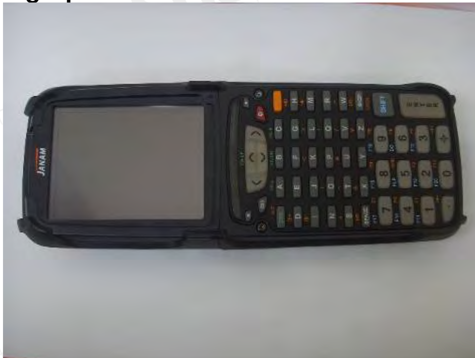
Fig.5 Front view of EUT