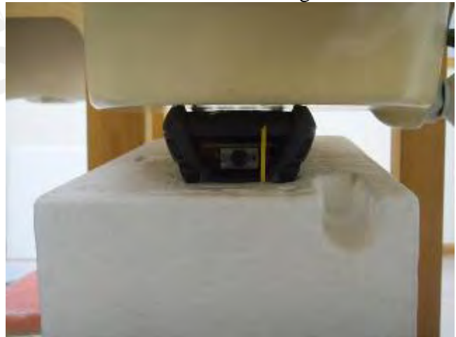
Fig.3 Front side of the EUT is paralleled and contact with flat phantom.