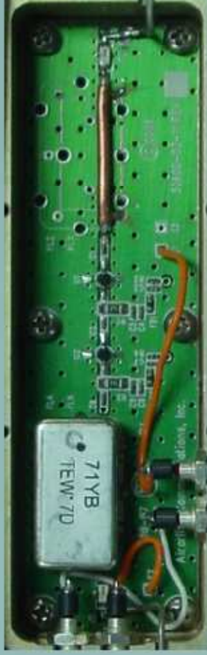
52600-03-11 INPUT FILTER AMPLIFIER TOP VIEW