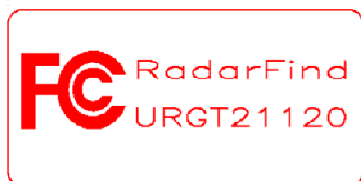
Non-status FCC Label