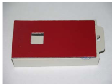
Apply adhesive to base 1st

If the target location is not completely flat you may need to add strips under the ends of the adhesive pad (cut the strips from a spare pad)