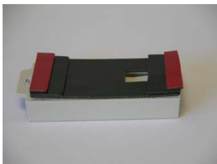
Building up adhesive to conform to curved substrates

If the target location is not completely flat you may need to add strips under the ends of the adhesive pad (cut the strips from a spare pad)