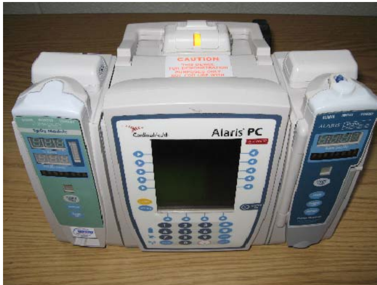
Example Status tag placement

Select a standard location on each asset type for the tag. For A-Status tags select a location where the status indicator is plainly visible and can be easily accessed by the user when switching the status switch. Be sure to choose a place where the tag is protected from physical impacts when the device is being used or transported.