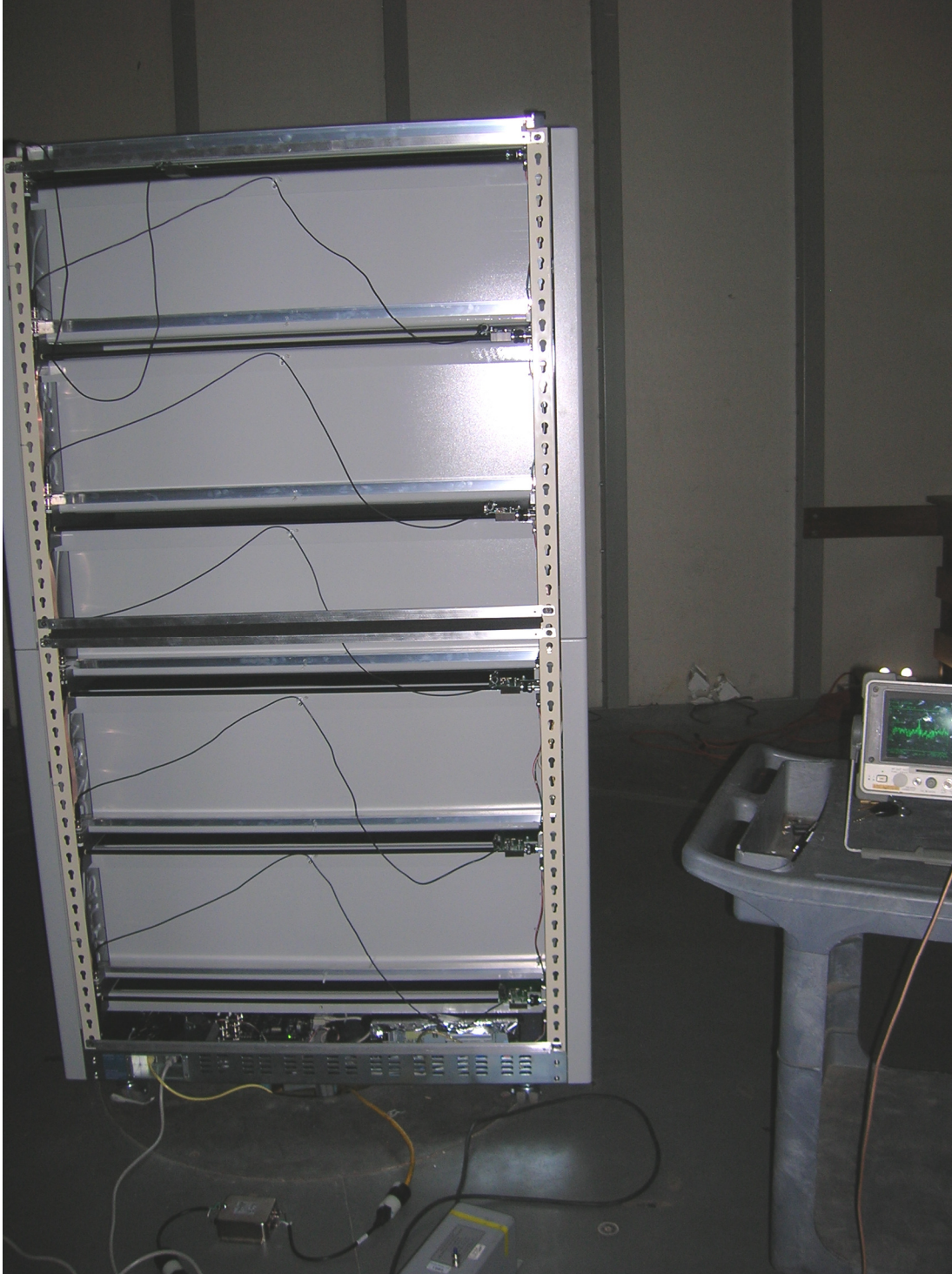
AC mains conducted emissions