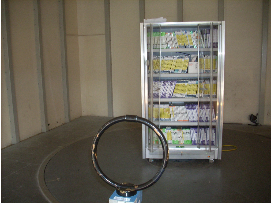
Fundamental Reading and spurious below 30MHz