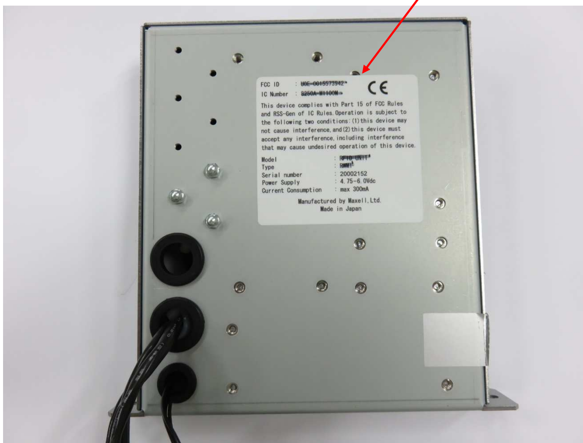
Wireless module surface and Antenna connection point (Back side)

Please see Exhibit (Label and Location) for labeling details.