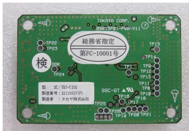
RF section (Back side)