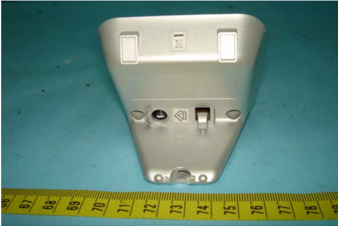
Bottom View of Charger