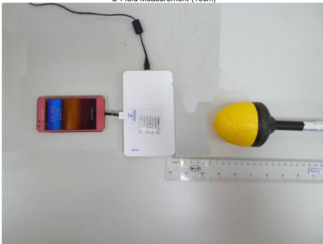
E-Field Measurement (10cm)