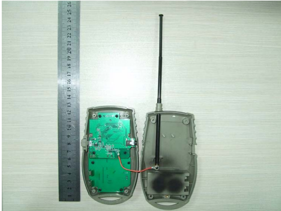
Internal View of Product