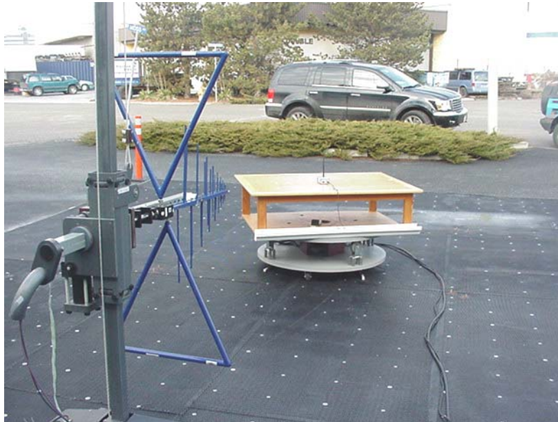
Photograph A.8-2 - DUT with Patch Antenna