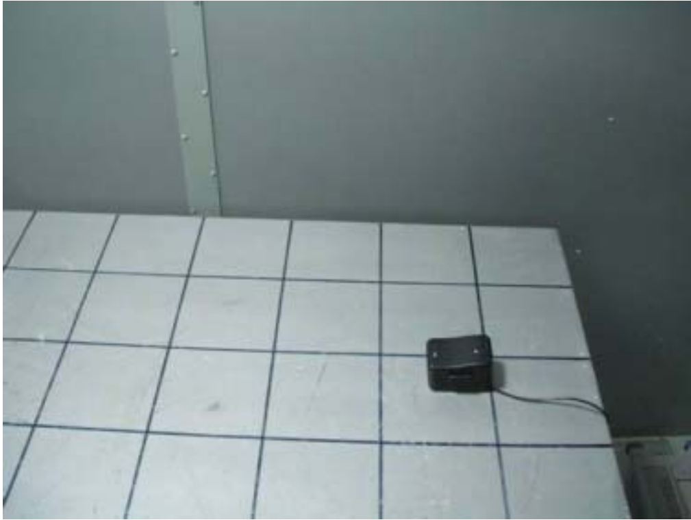
POWER LINE CONDUCTED TEST