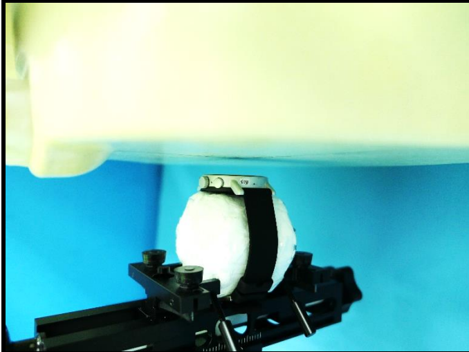
Front Face of EUT at 10 mm