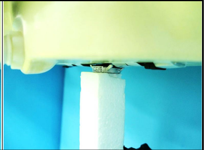
Rear Face of EUT at 0 mm