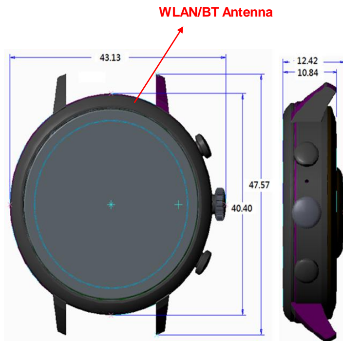
<EUT Front View>

The separation distance for antenna to edge: