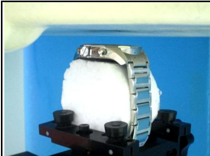
Front Face of EUT at 10 mm