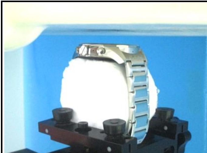
Front Face of EUT at 10 mm