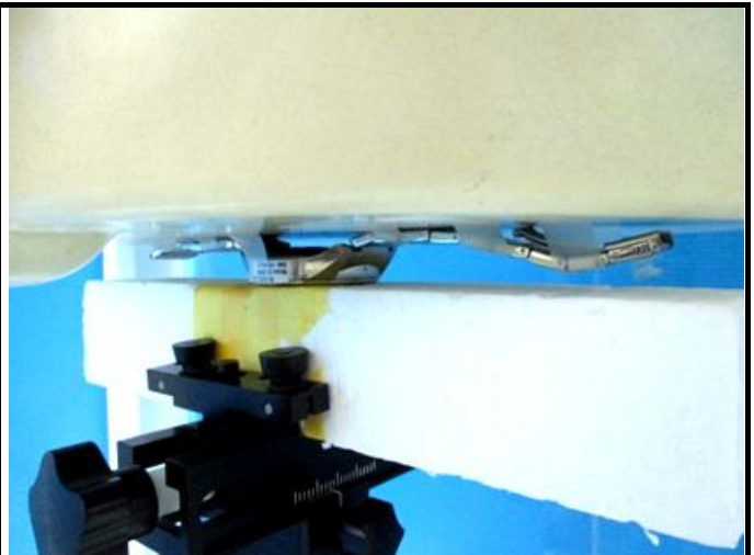
Rear Face of EUT at 0 mm