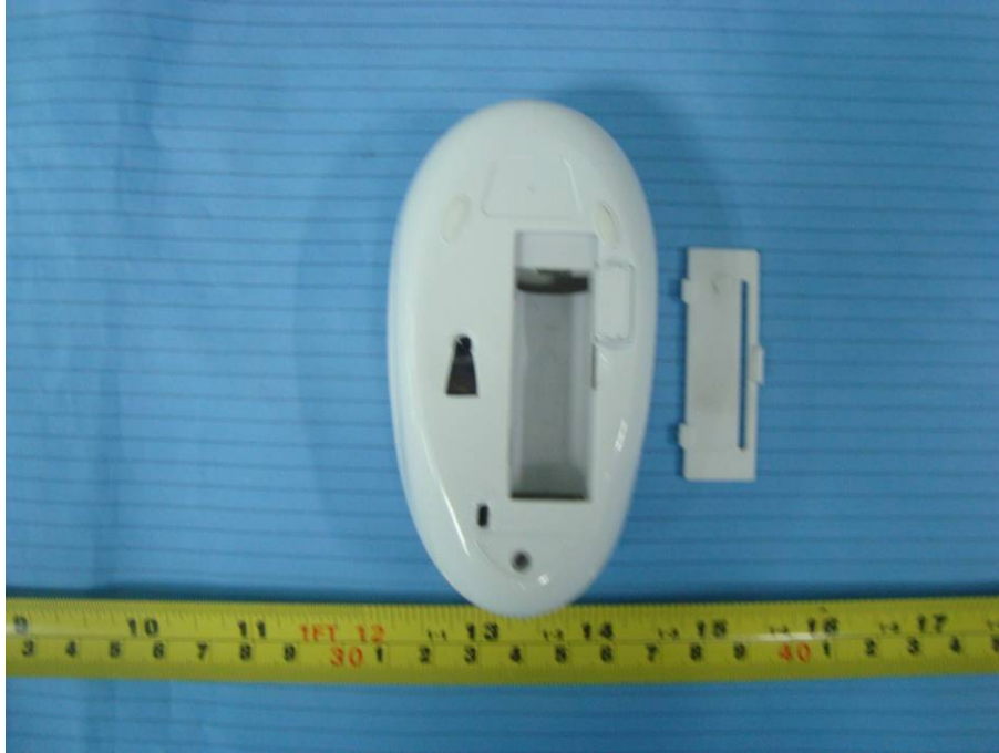
EUT – Cover off View