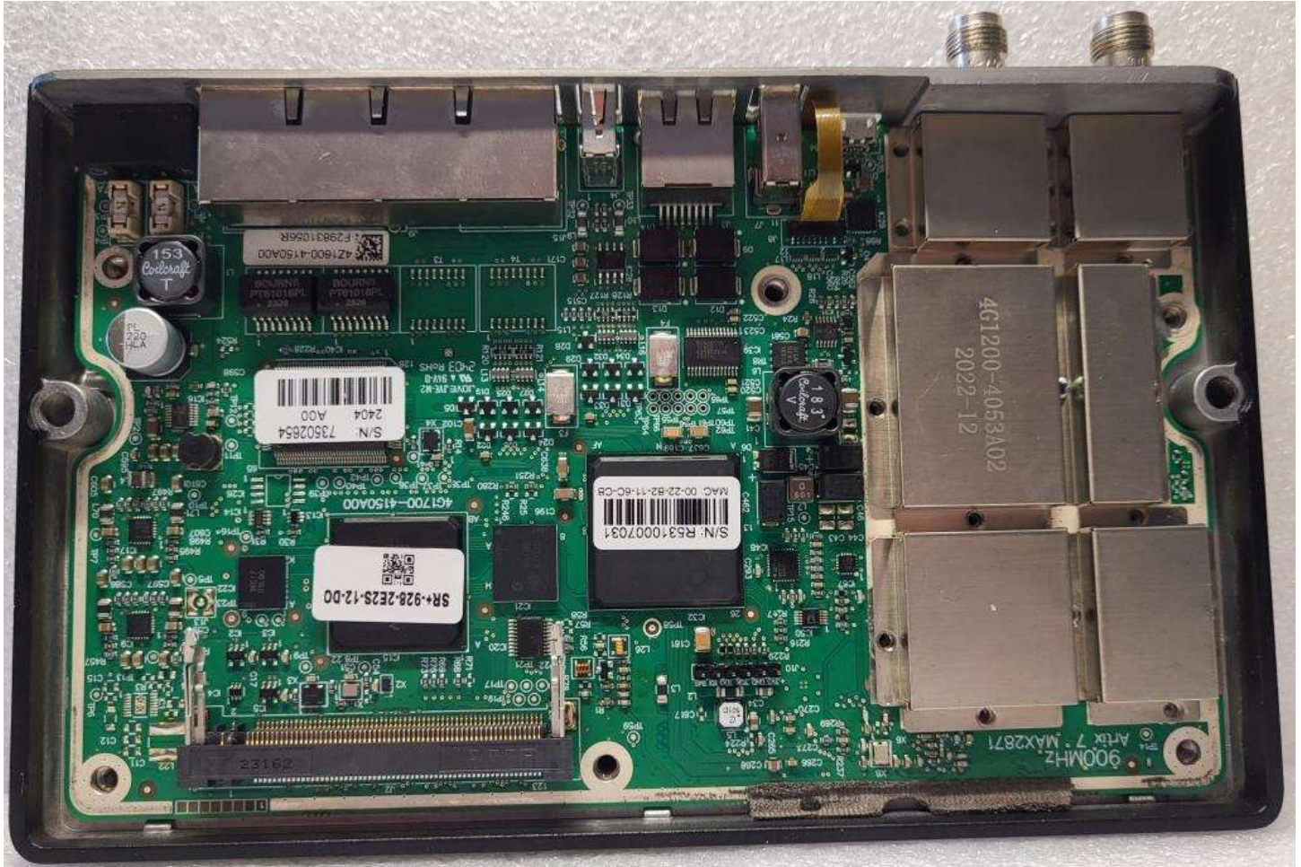
Figure E9.1 – Internal, Top Removed